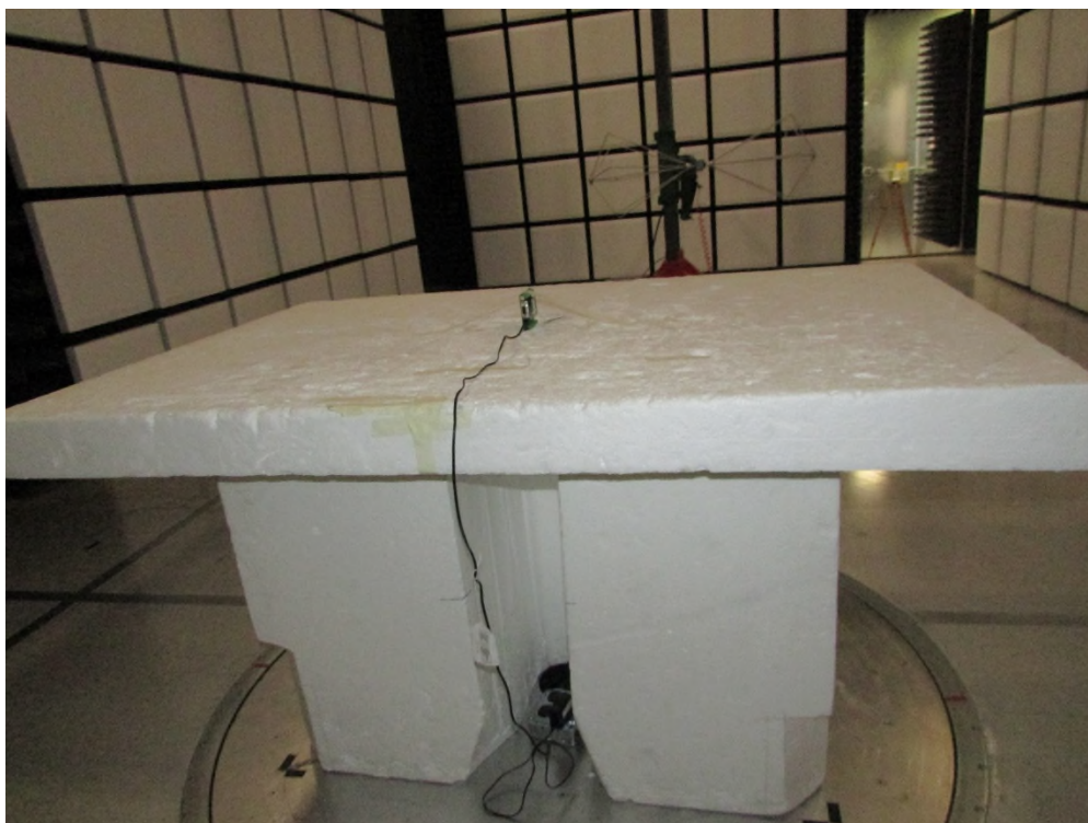
Figure 2: Radiated Emissions – Back – Y-Plane – Below 1GHz