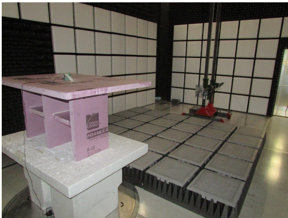
Figure 4: Radiated Emissions –Back – Y-Plane – Above 1GHz