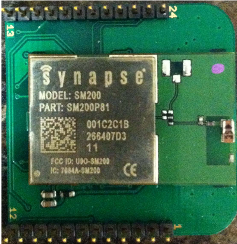
Figure 5: – External Photo – RF200P81, Top