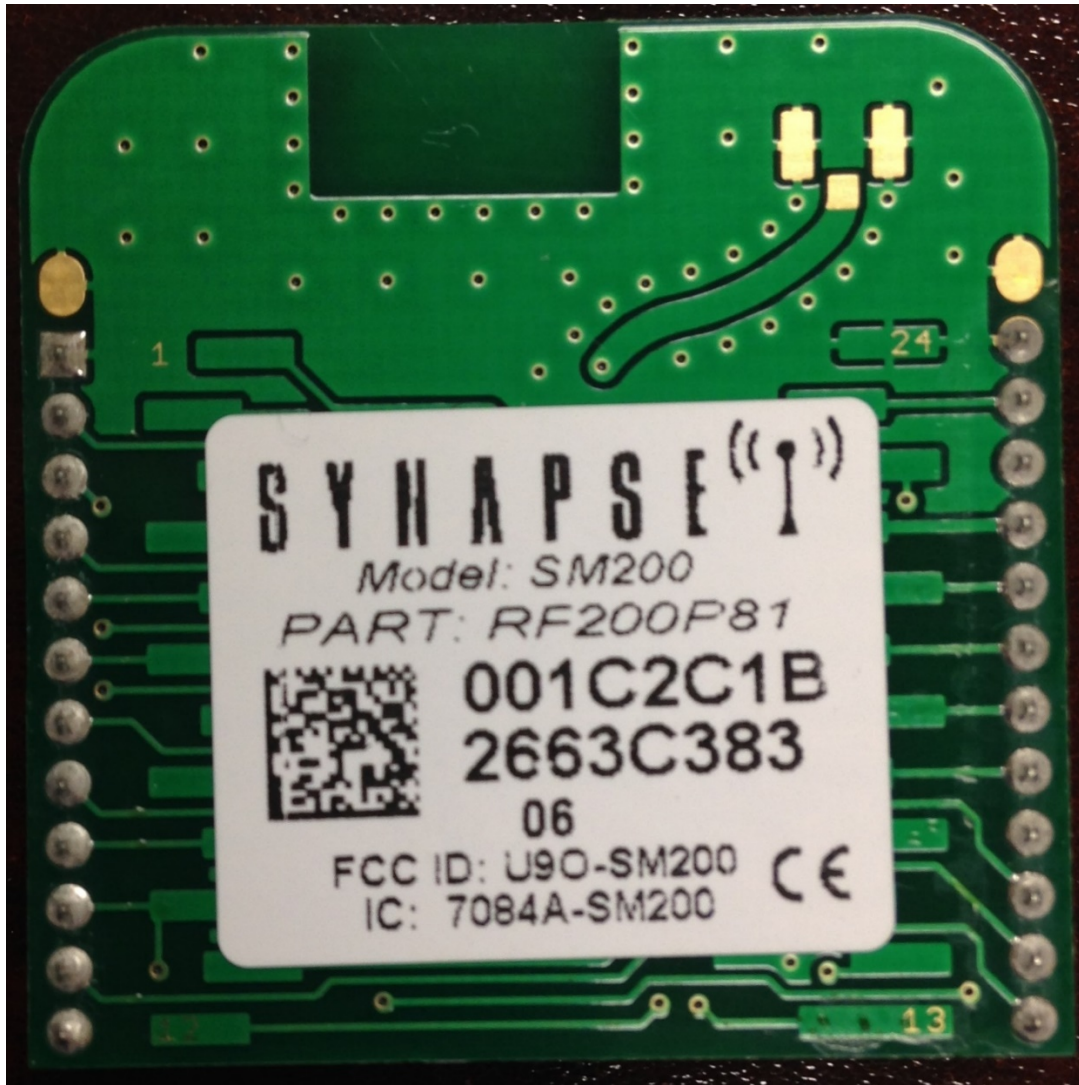
Figure 4: – External Photo – RF200P81, Bottom

For RF200PU1, the label is the same as Figure 4 with the following changes: