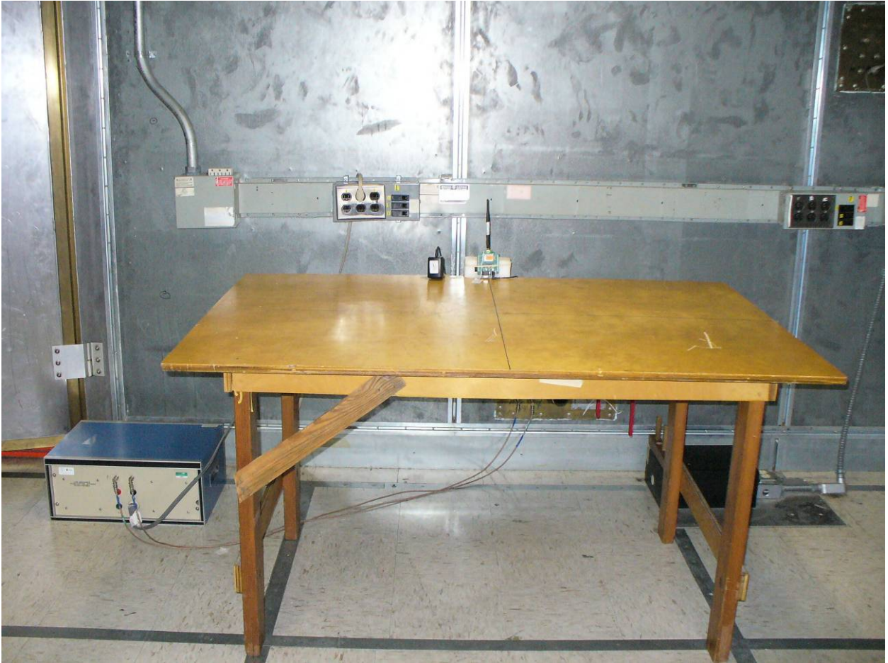
Figure 6: Power Line Conducted Emissions – Front View (RF200APD1)