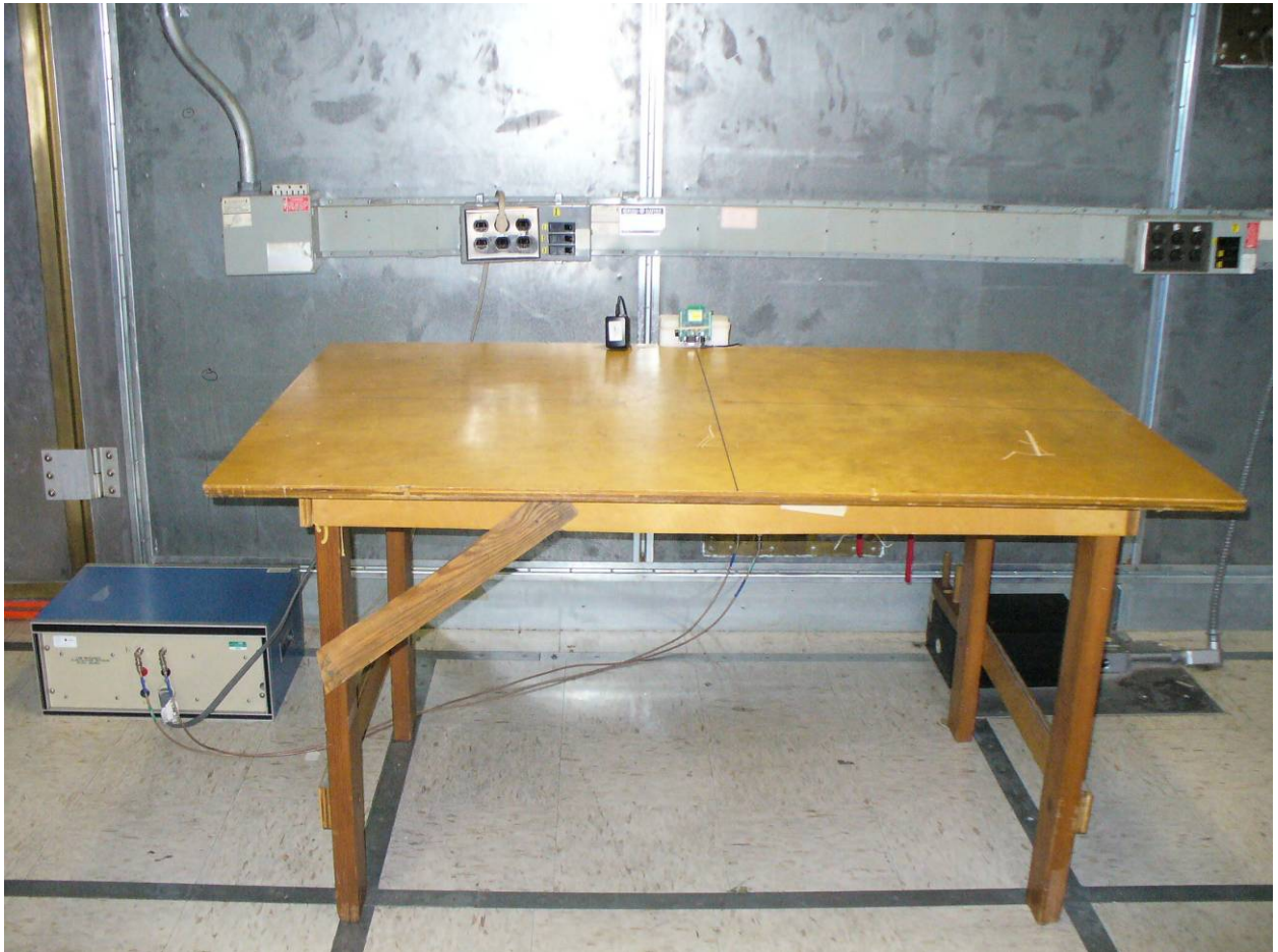
Figure 8: Power Line Conducted Emissions – Front View (RF200APF1)