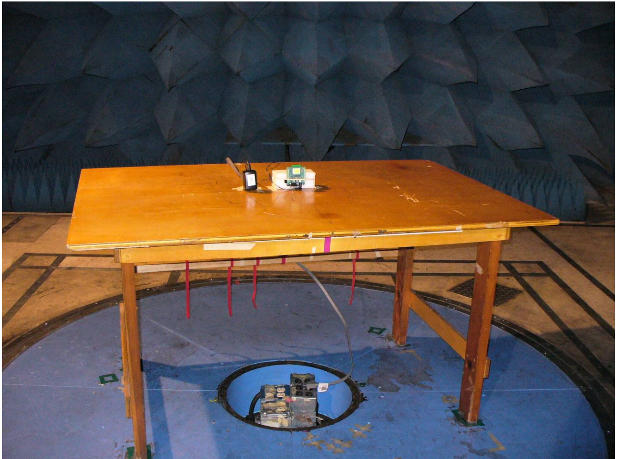
Figure 3: Radiated Emissions – Front View (RF200APF1)