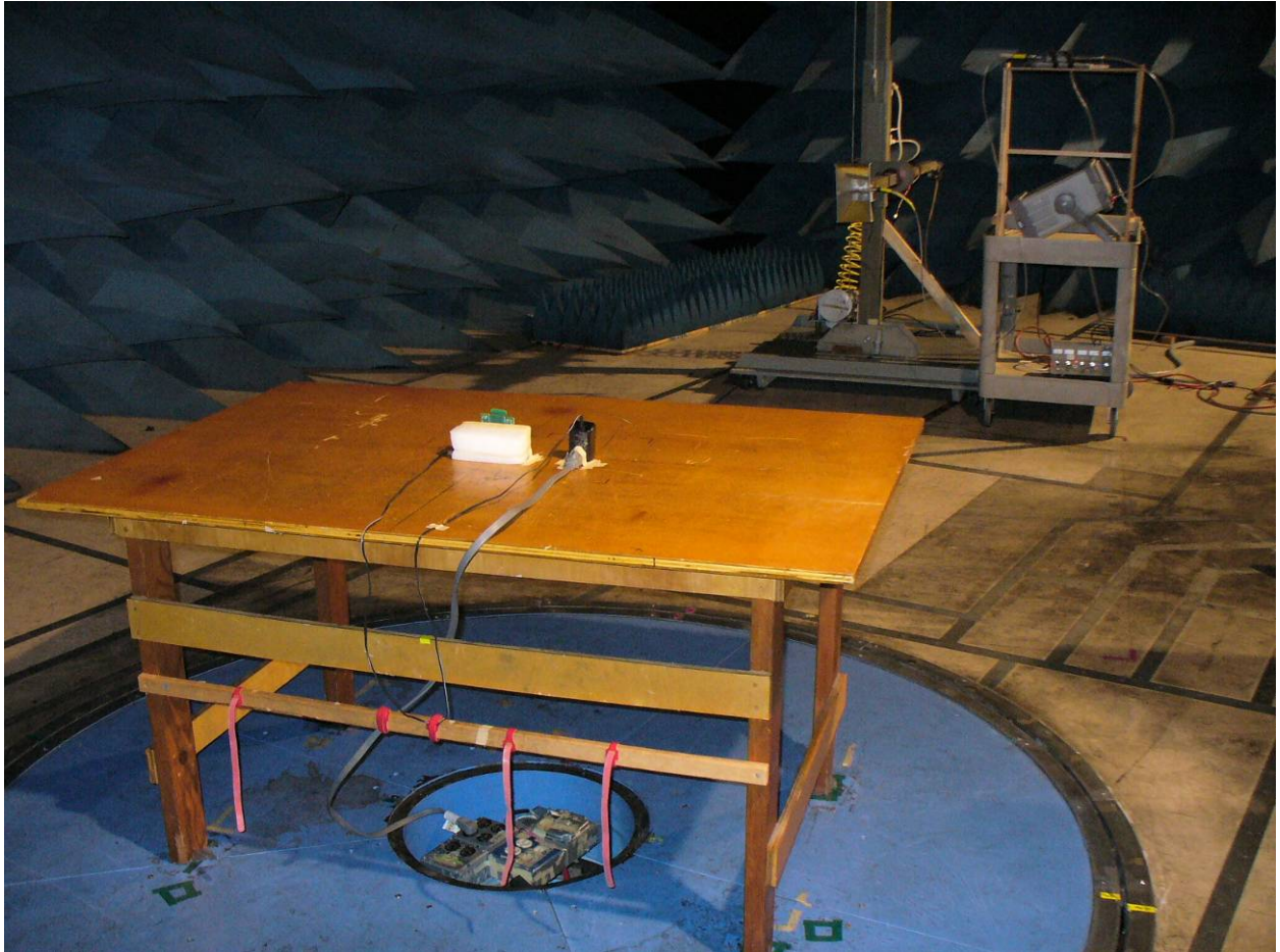
Figure 4: Radiated Emissions – Back View (RF200APF1)