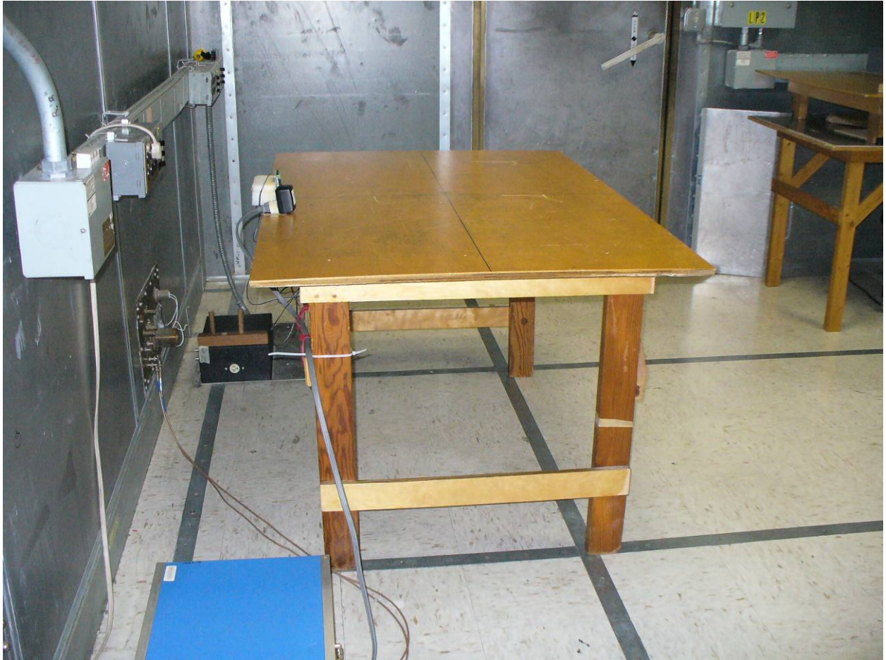
Figure 9: Power Line Conducted Emissions – Side View (RF200APF1)