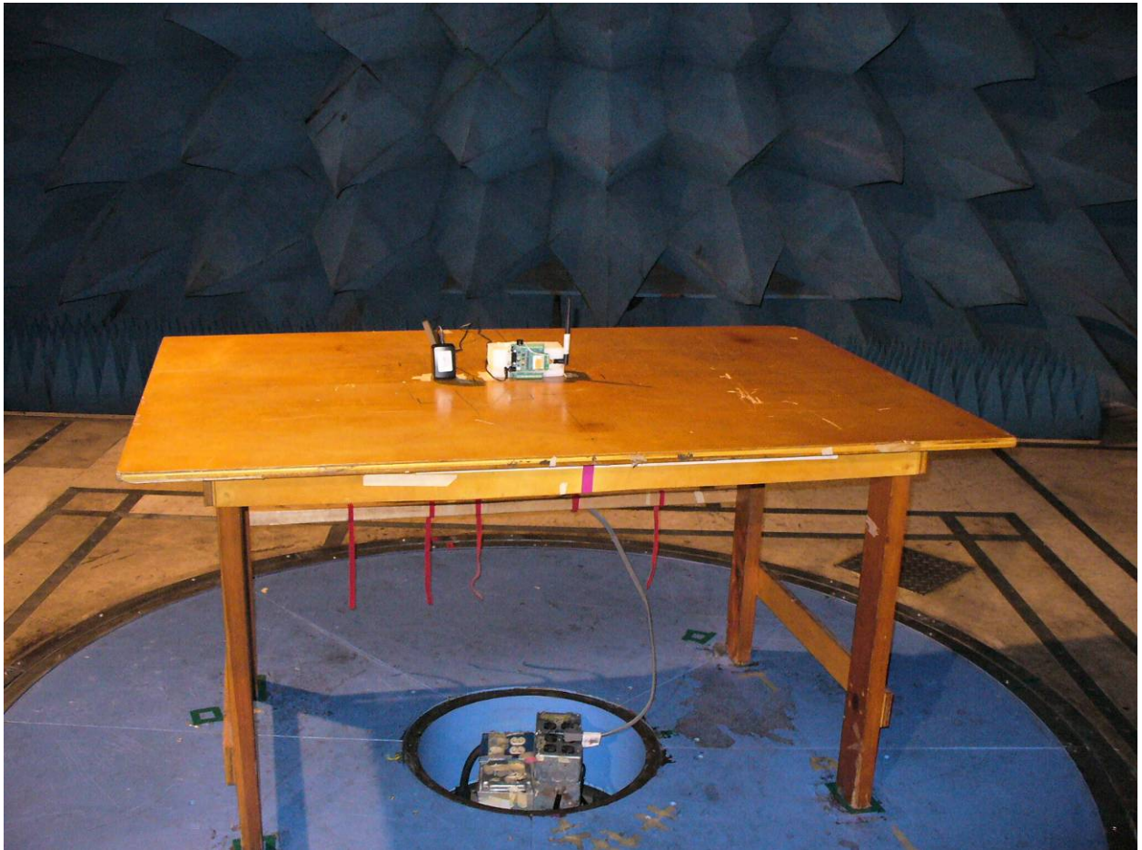
Figure 1: Radiated Emissions – Front View (RF200APD1)