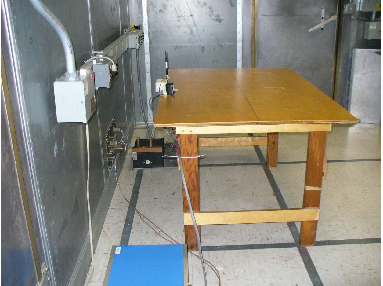
Figure 7: Power Line Conducted Emissions – Side View (RF200APD1)