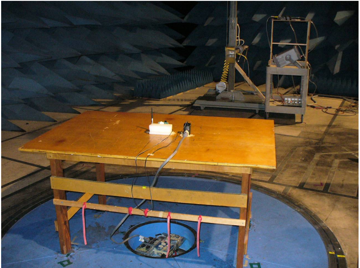
Figure 2: Radiated Emissions – Back View (RF200APD1)