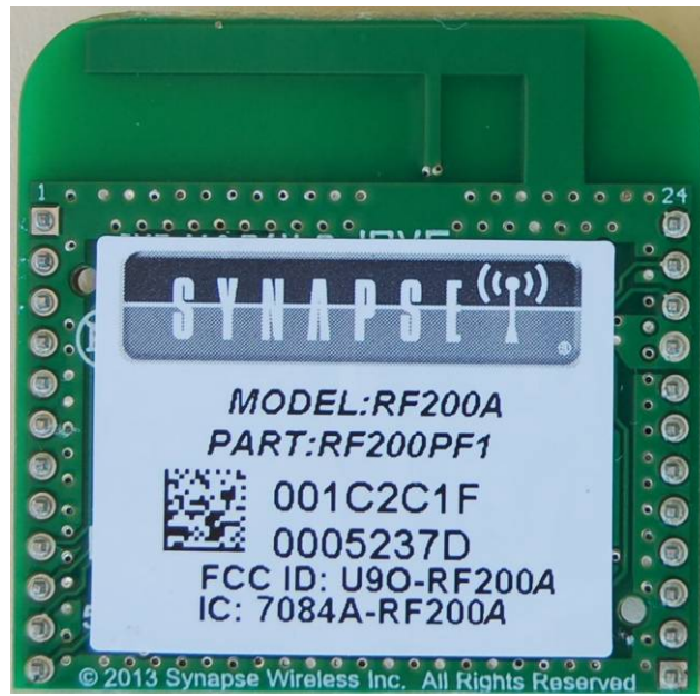
Figure 3: Top View (RF200APF1)