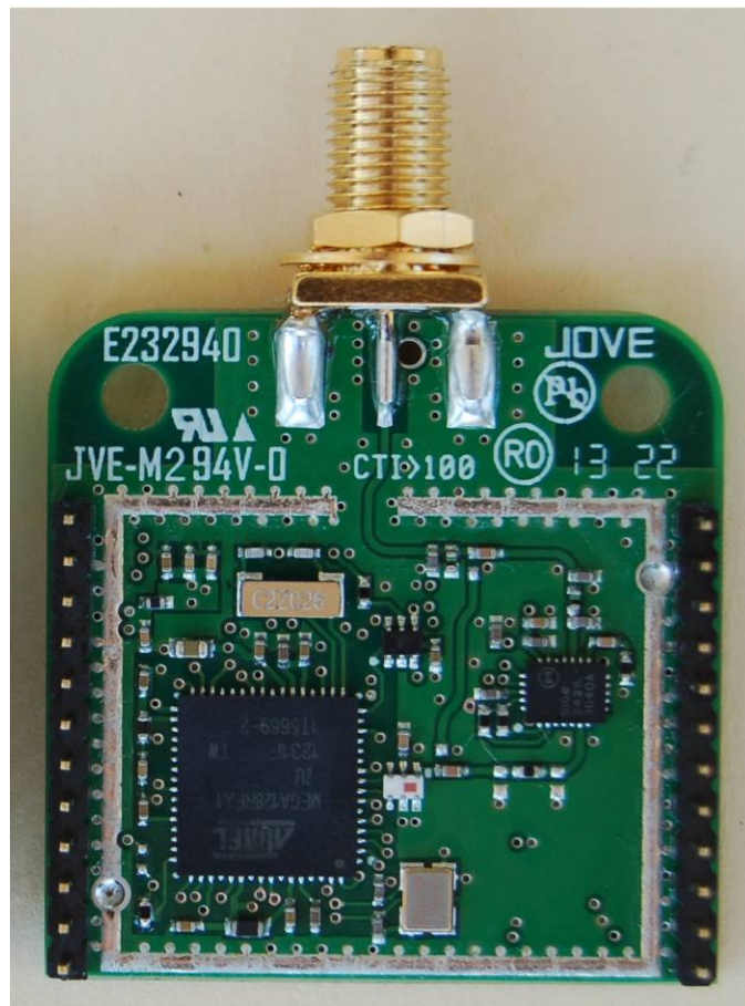
Figure 2: Bottom View - without shielding (RF200APD1)