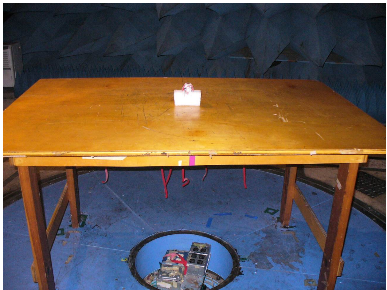
Figure 1: Radiated Emissions – Front View