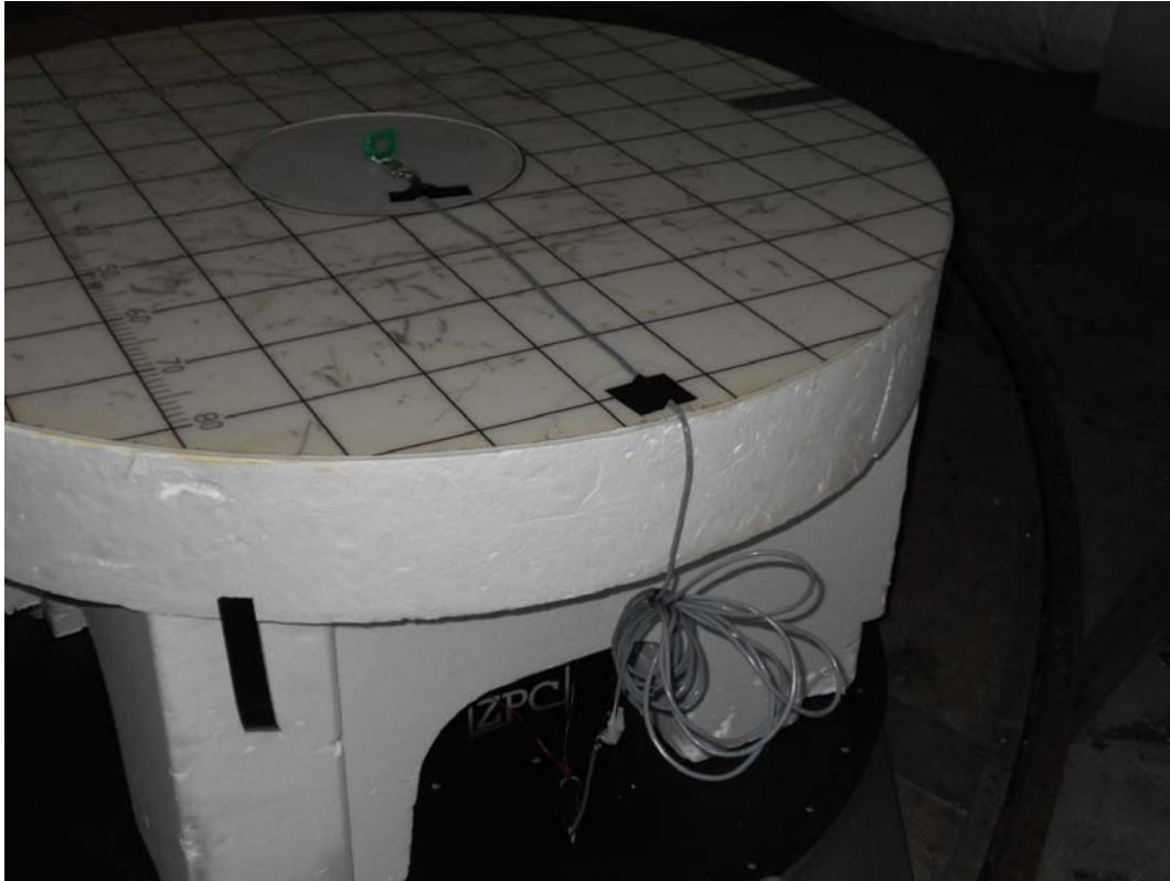
8616103 module with 8001204 antenna