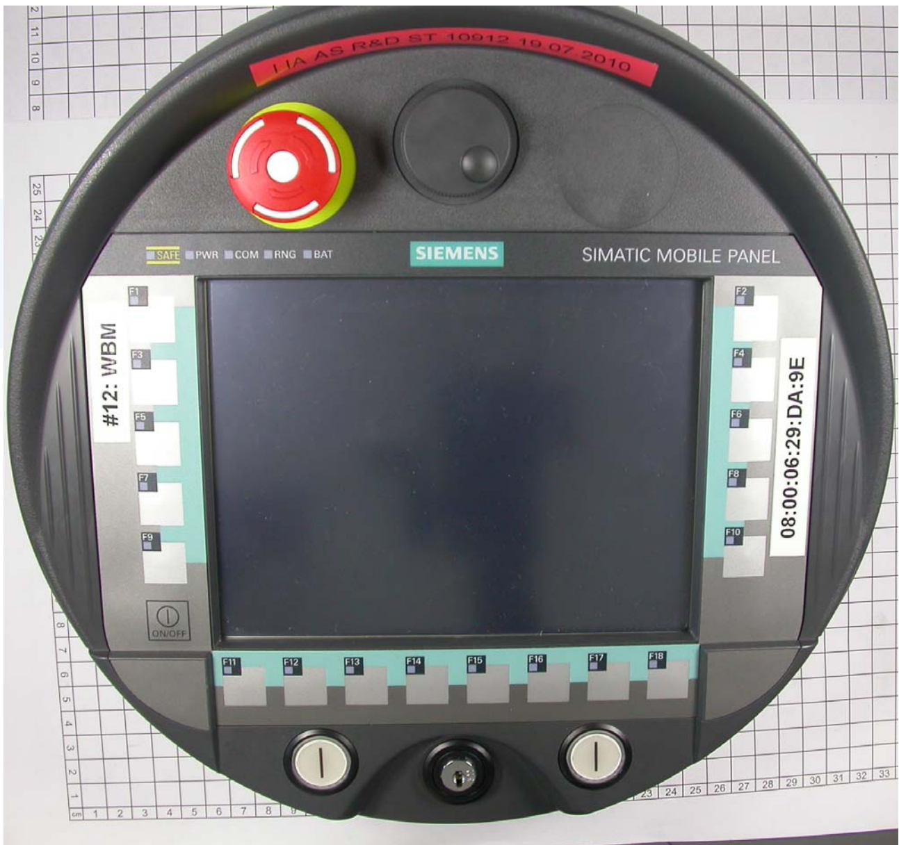
Front view Model: MobilePanel277FIWLAN V2