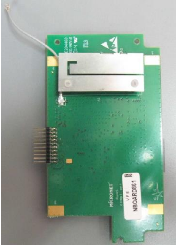
Tellit modem with FCC-ID, in the bottom side