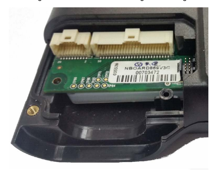
Figure 8:SmartHub UnderdashOBC Interface connectors

In addition, Micronet provides engineering cable design for its customers if necessary, the customers can manufacture the cable according Micronet's scheme or according to their design.