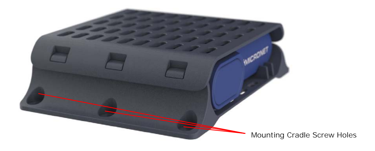
Figure 6:Micronet SmartHubUnderdash Mounting CradleLeft View