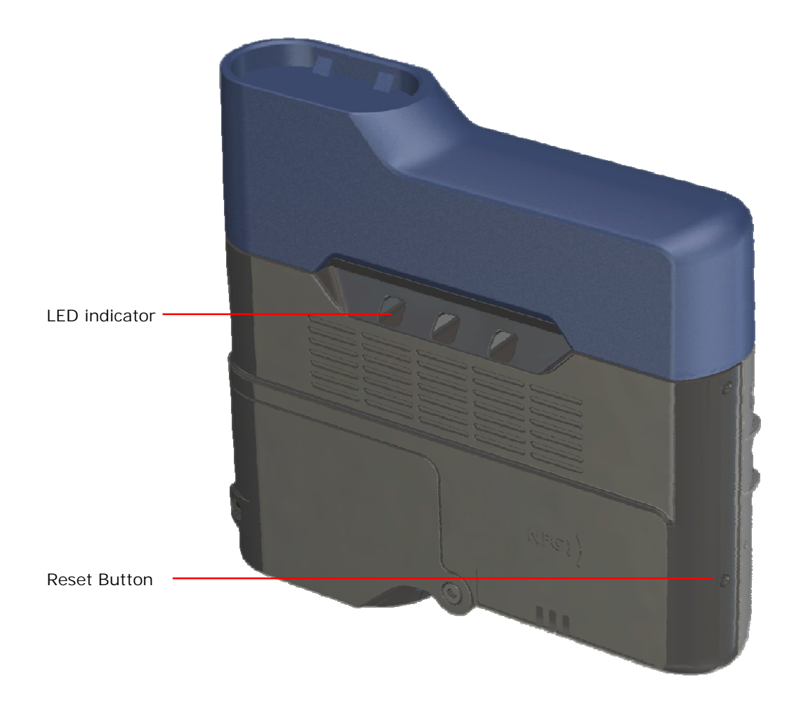
Figure 3:Micronet SmartHub Underdash Front Panel View

For more information about the Micronet Smart HubUnderdash bottom panel view, see: