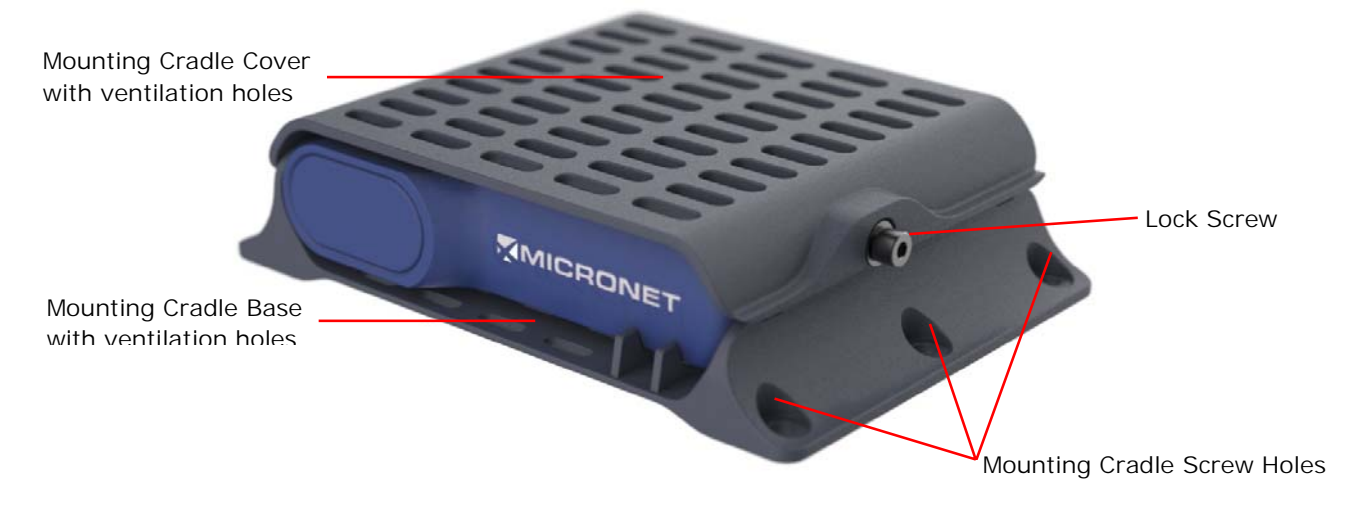
Figure 5: Micronet SmartHubUnderdash Mounting CradleRight View

The cradle has six holes to assemble under the dashboard of to another place.