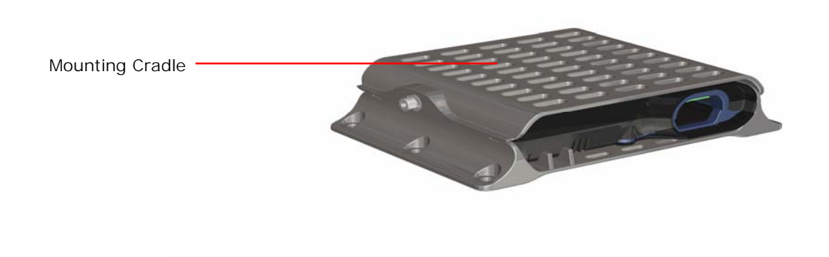
Figure 2: Micronet SmartHub UnderdashRear Panel View

For more information about the Micronet SmartHubUnderdashrear panel view, see: