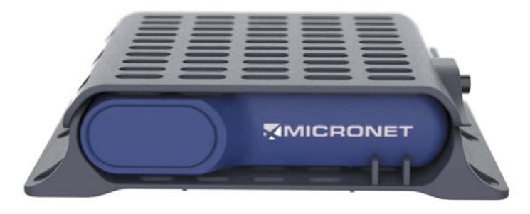
Figure 7: Customized Logo

Micronet provides the option to attach a customized logo based on your specifications. To enable rebranding the product, Micronet will provide graphic files and size specifications. This is subject to an additional charge per unit and MOQ.