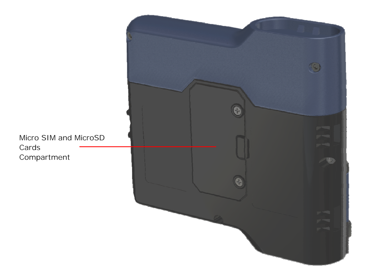
Figure 4:Micronet SmartHubUnderdash Top Panel View

For more information about the Smart Hub Underdash toppanel component, see: