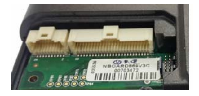
Figure 9:SmartHub Underdash OBC Interface connectors

The SmartHubUnderdashOBC interface contains MolexPico-Clasp™ Wire-to-Board Header 1.00 mm pitch 20 and 50 pin connectors. All pins are ESD protected (against electrostatic discharge). The Main Connector Pinout and SecondaryConnectorPinout tables below describe the pinout of each connector.