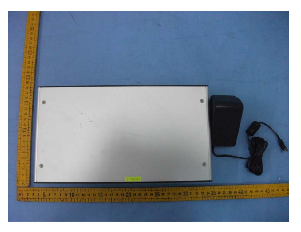
Figure 2 The EUT-Back View