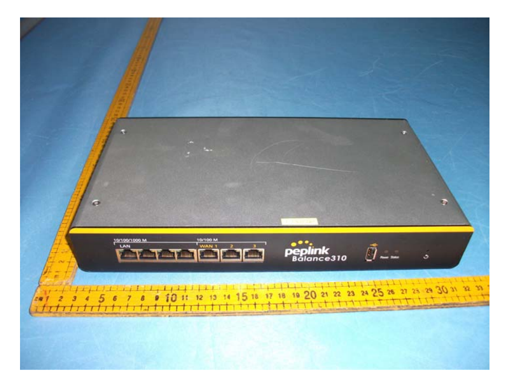
Figure 4 The EUT-Side View