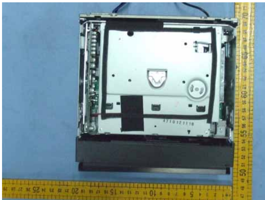
Figure 4 The EUT-Back View