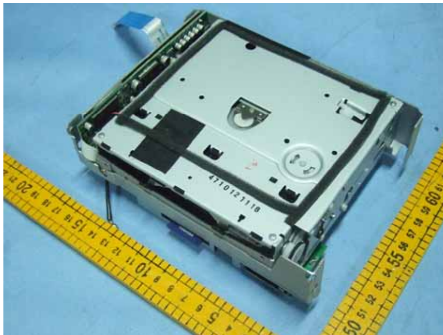
Figure 6 The EUT-Back View