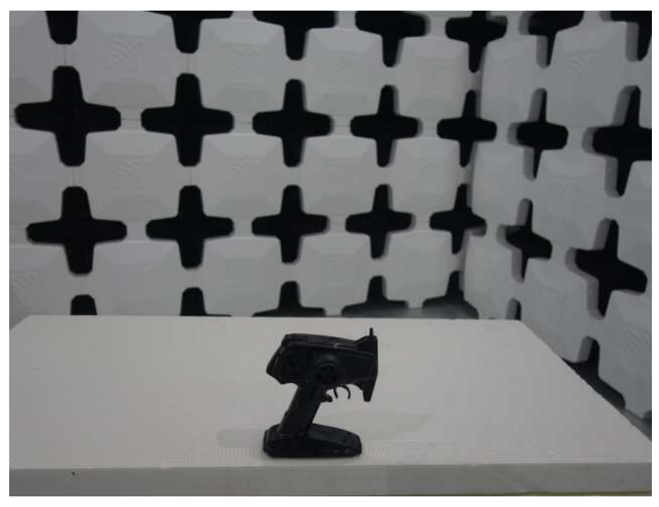
Up to 1GHz (The EuT placed at the center of the turntable)