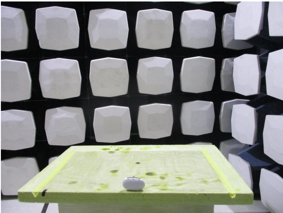
Up to 1GHz (EUT was placed in the centre of the turntable)