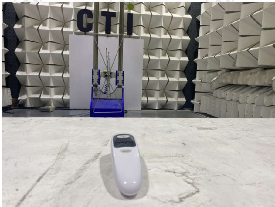
Radiated spurious emission Test Setup-2(Below 1GHz) close up photo