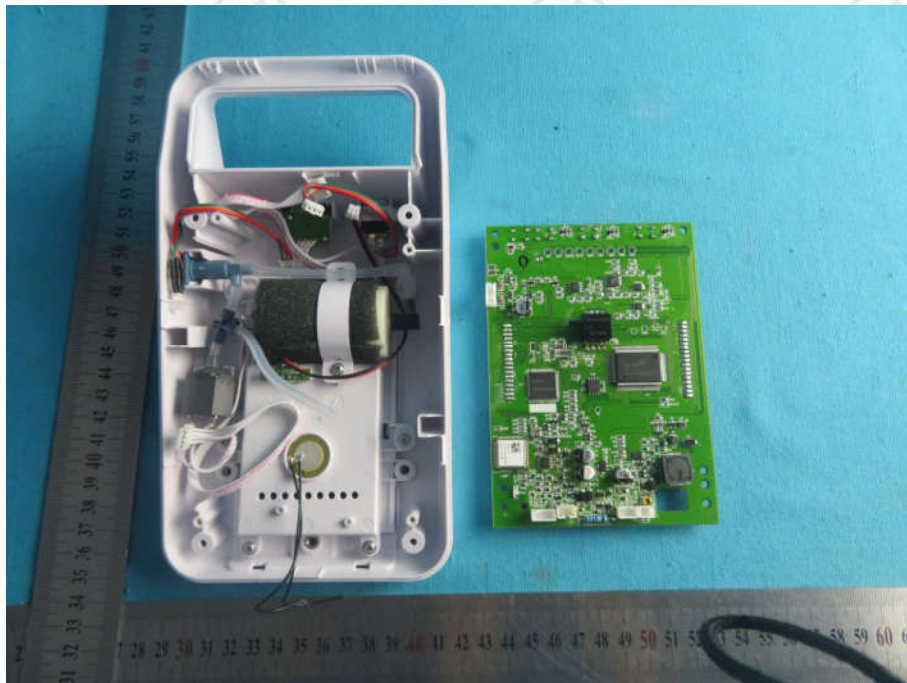
View of Product-9