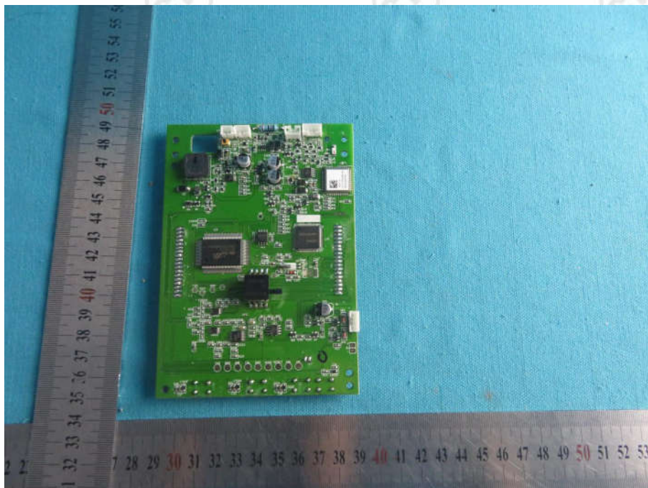
View of Product-10