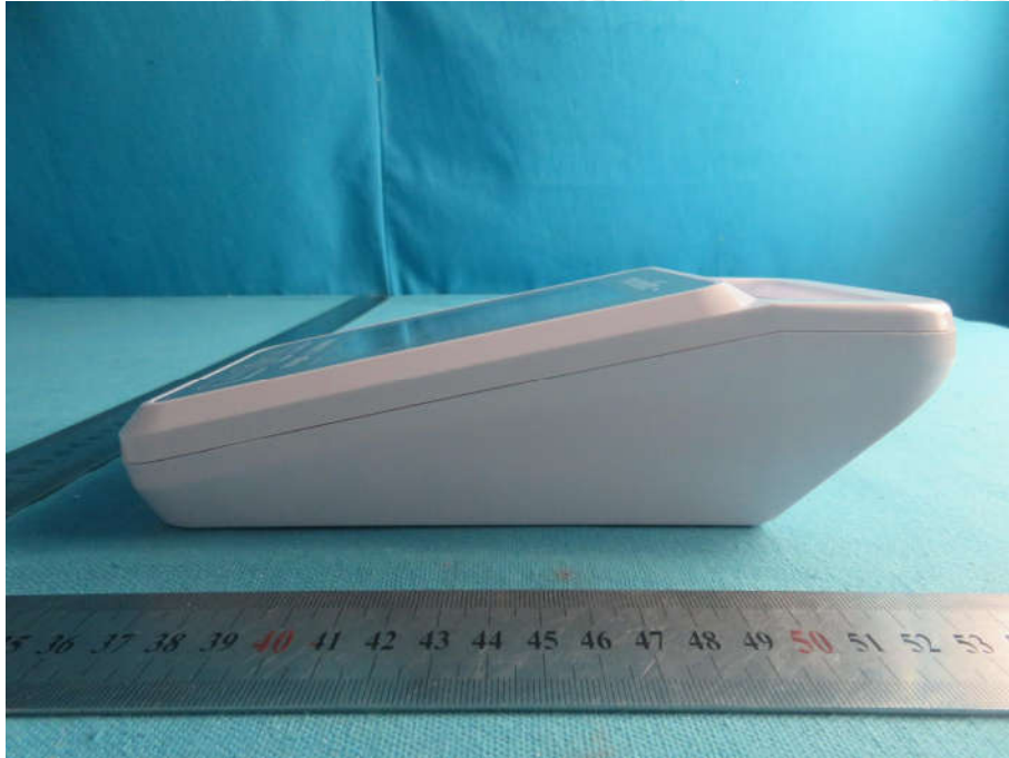
View of Product-7