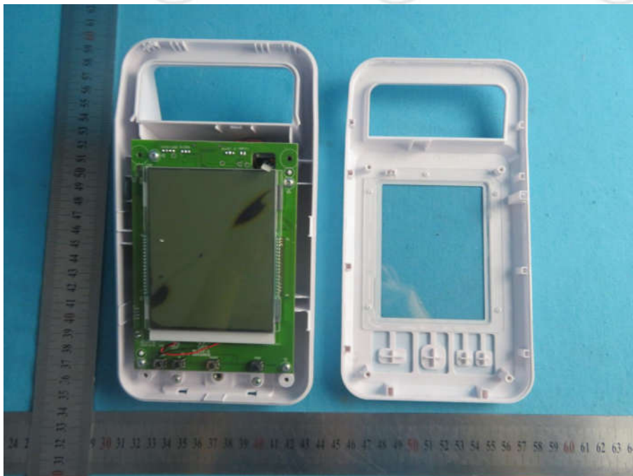
View of Product-8