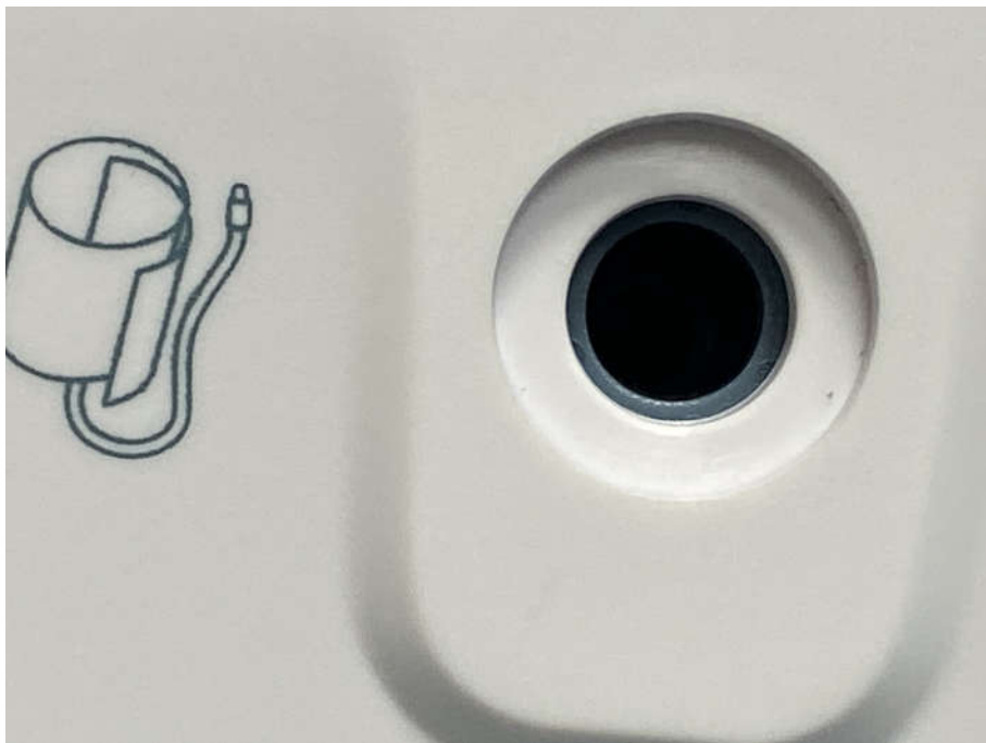
View of Product-8