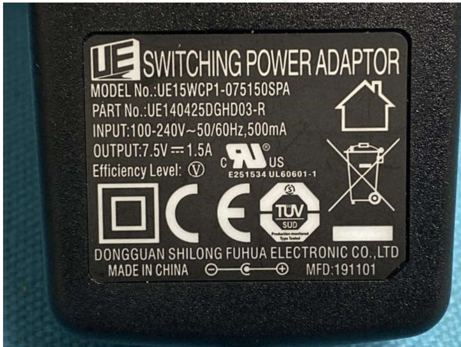
View of Product-11