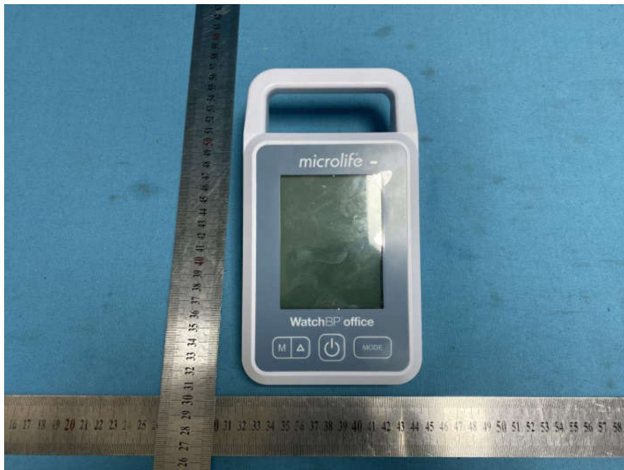
View of Product-2