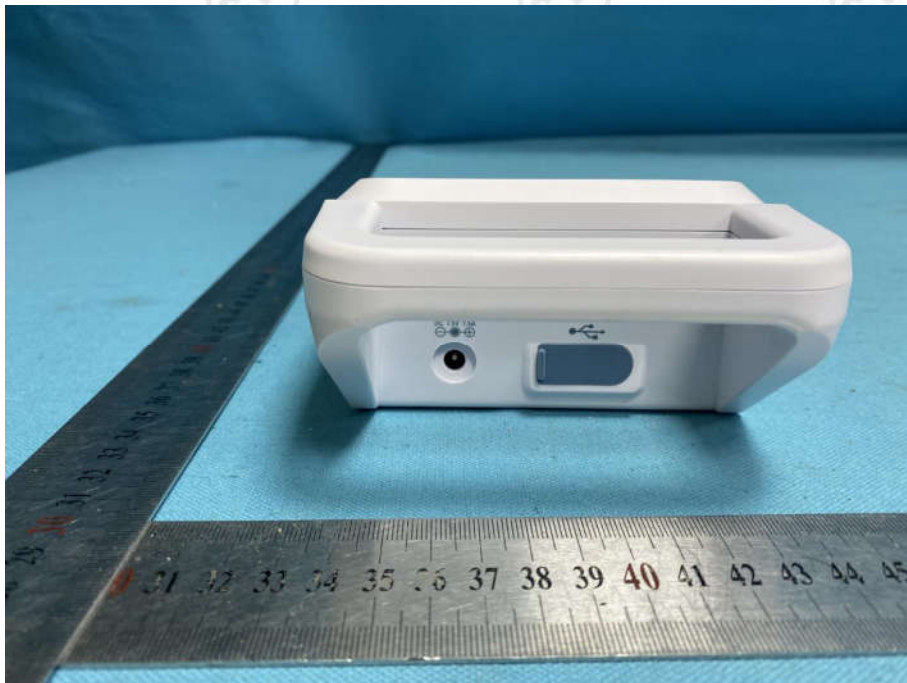
View of Product-6