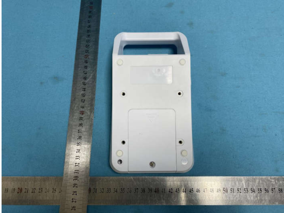
View of Product-3