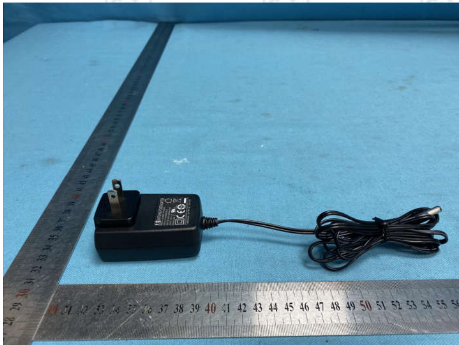
View of Product-10