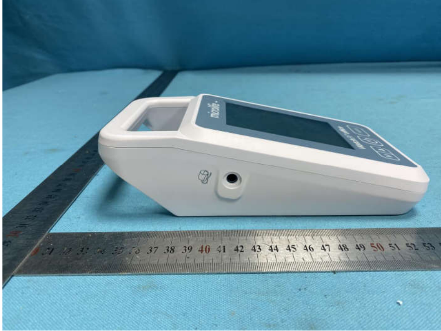
View of Product-7