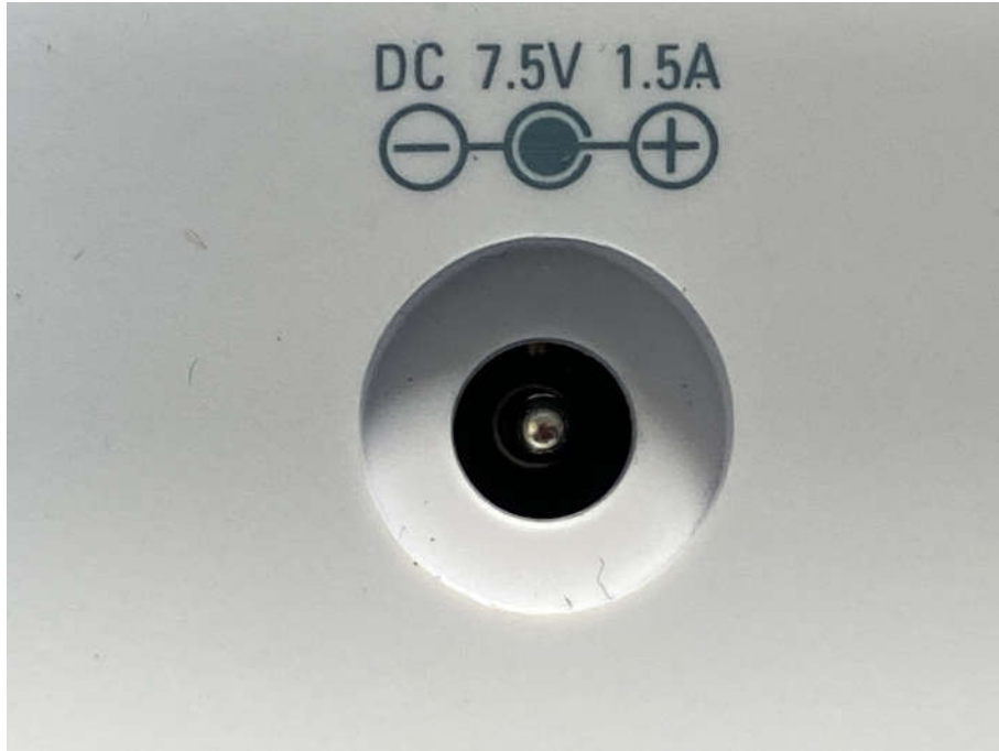
View of Product-9