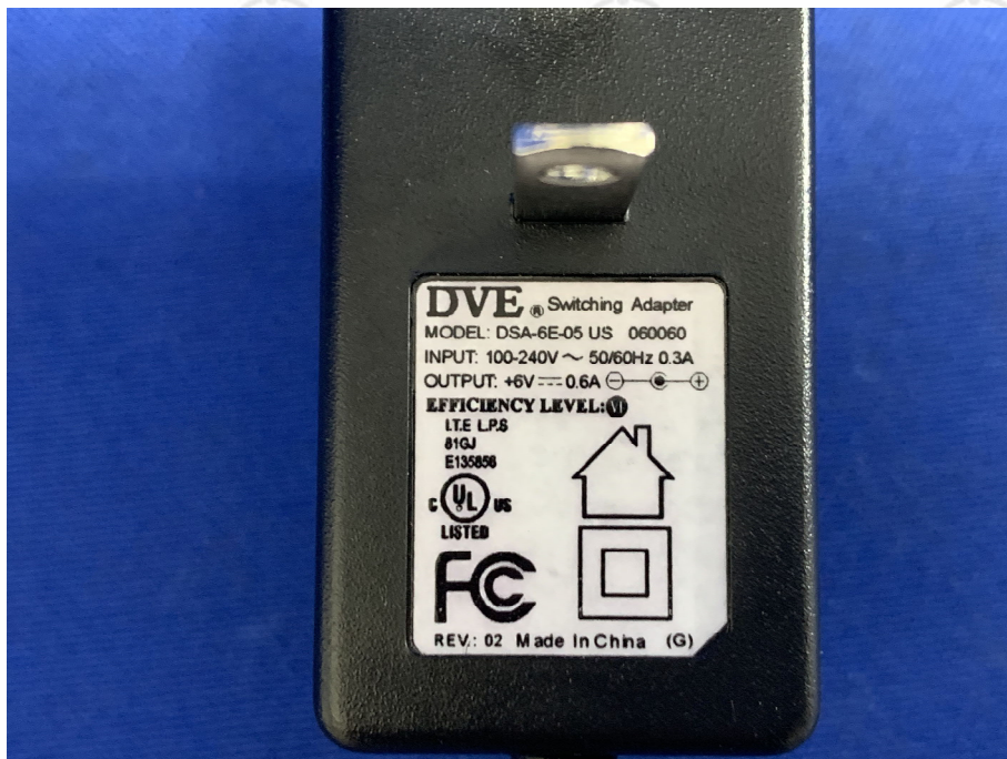
View of Product-18