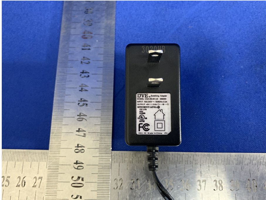
View of Product-17