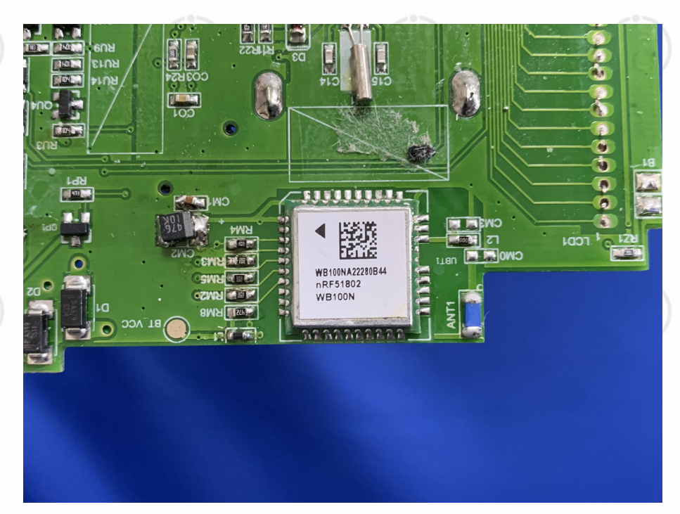
View of Product-14