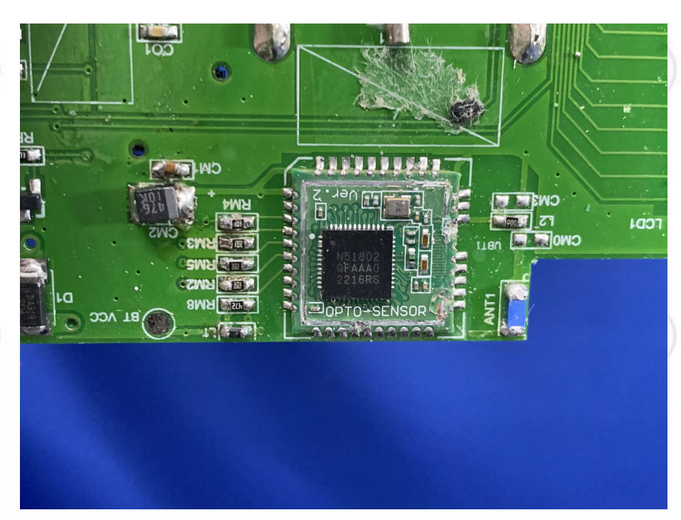
View of Product-15