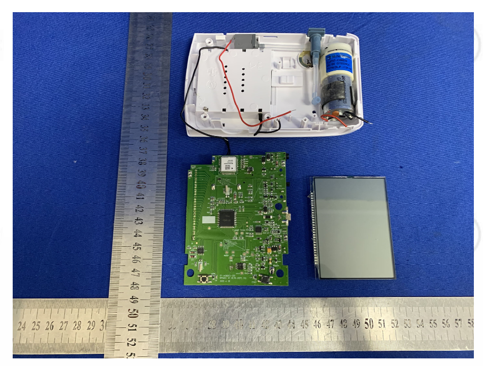
View of Prodct-11

Report No. : EED32P81107301 Page 39 of 43