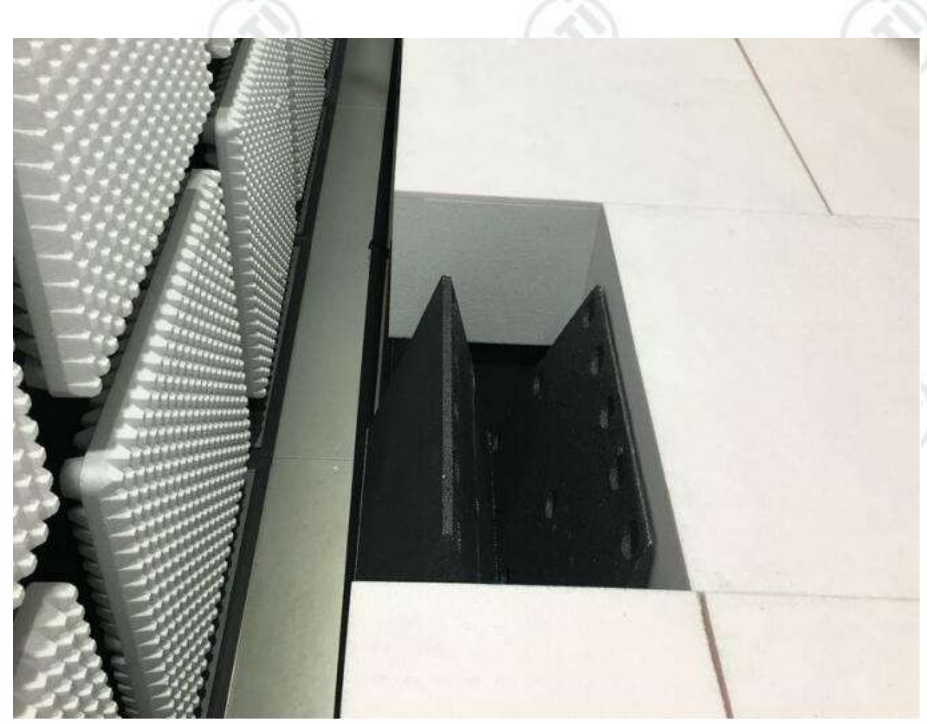
Radiated spurious emission Test Setup-3(Above 1GHz) There are absorbing materials under the ground.

Report No.: EED32P80883901 Page 33 of 42