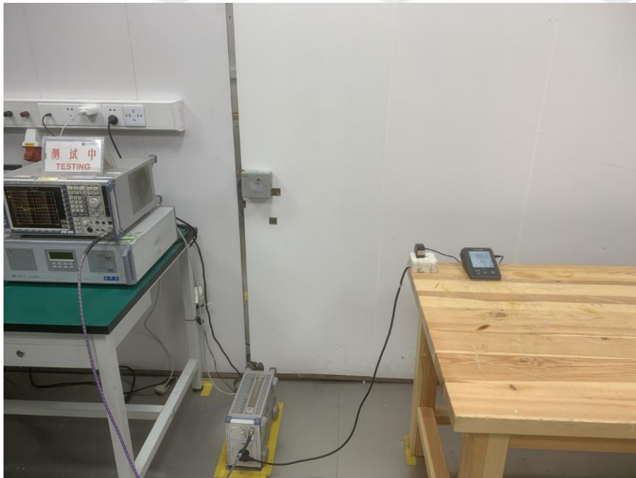
AC Power Line Conducted Emission