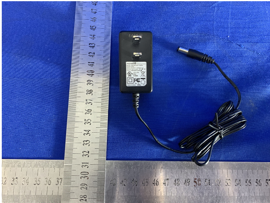
View of Product-17