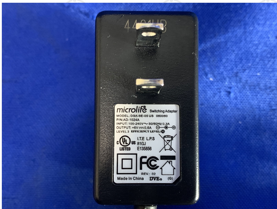
View of Product-18