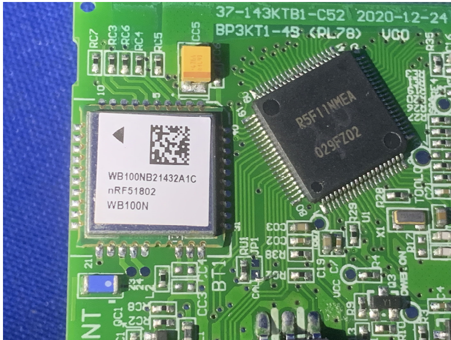
View of Product-17

The test report is effective only with both signature and specialized stamp, The result(s) shown in this report refer only to the sample(s) tested. Without written approval of CTI, this report can't be reproduced except in full.