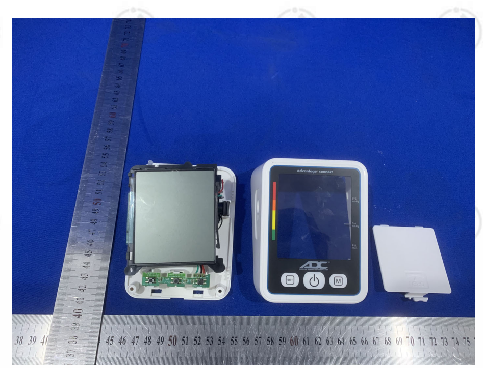
View of Product-9

Report No.: EED32N81315701 Page 37 of 41