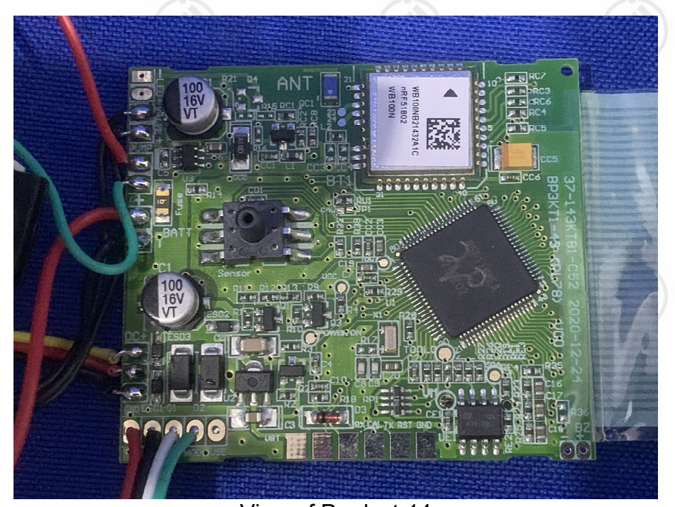
View of Product-14