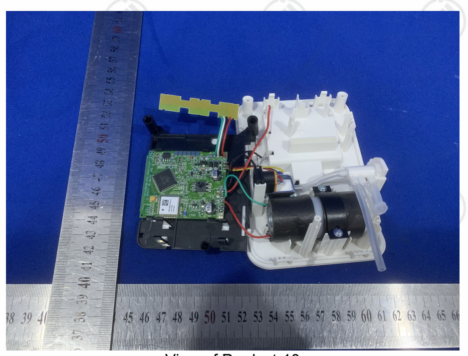
View of Product-10