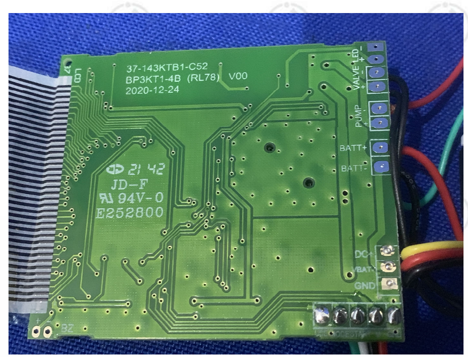
View of Product-13

Report No.: EED32N81315701 Page 39 of 41