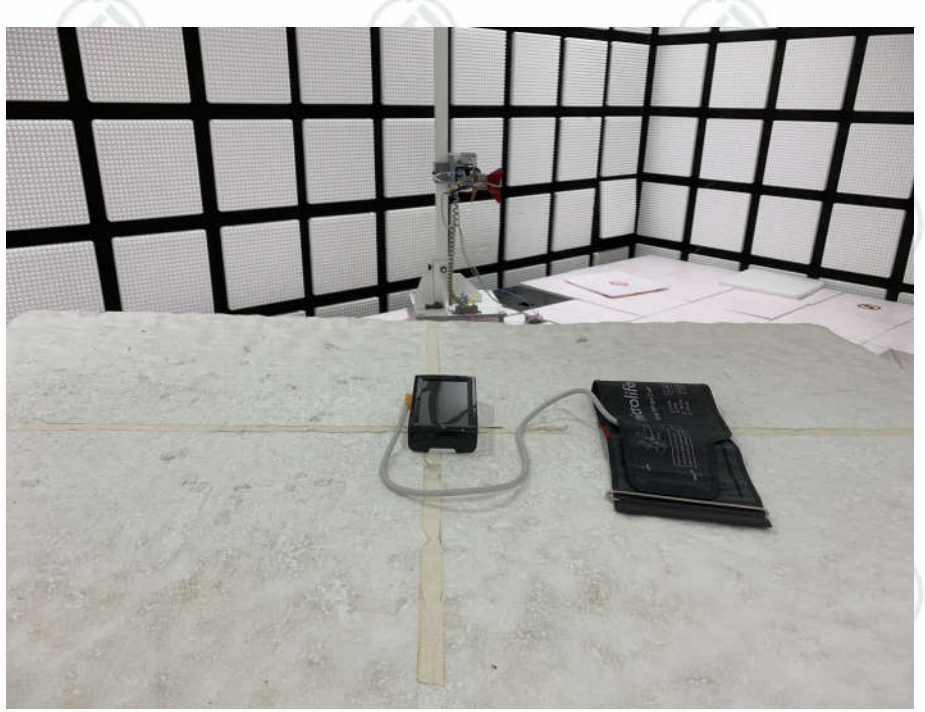
Radiated spurious emission Test Setup-2(Above 1GHz)

Hotline: 400-6788-333 www.cti-cert.com E-mail: info@cti-cert.com Complaint call: 0755-33681700 Complaint E-mail: complaint@cti-cert.com