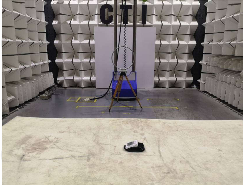
Radiated spurious emission Test Setup-1(Below 30MHz)