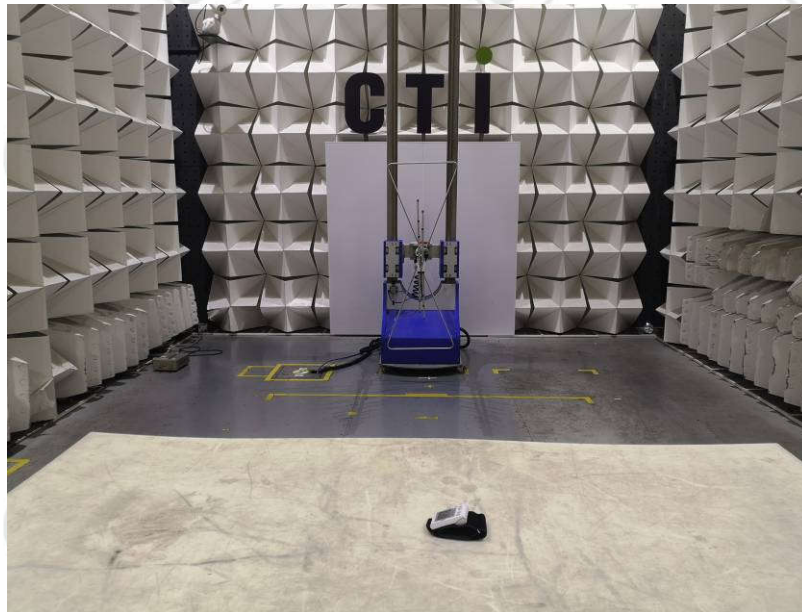
Radiated spurious emission Test Setup-2(Below 1GHz)