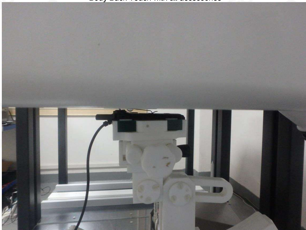
The thickness of EUT is 1.5 cm