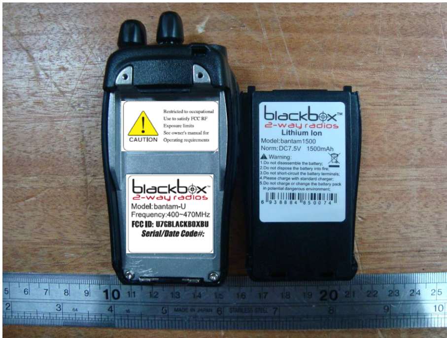
EUT – Uncover View