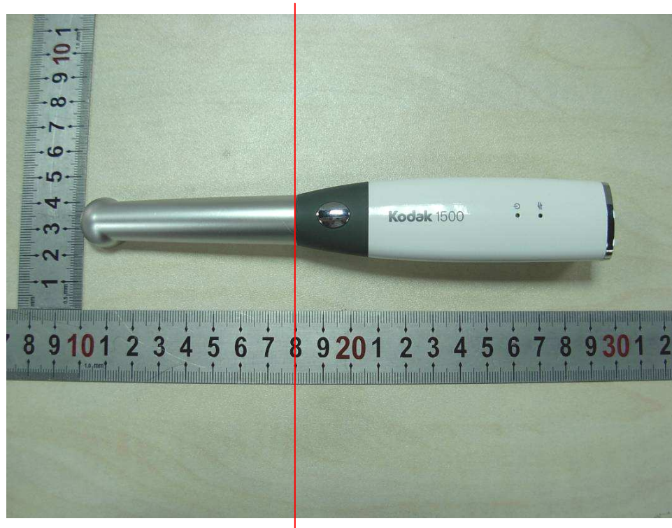
Boundary between inside/outside mouth for the camera