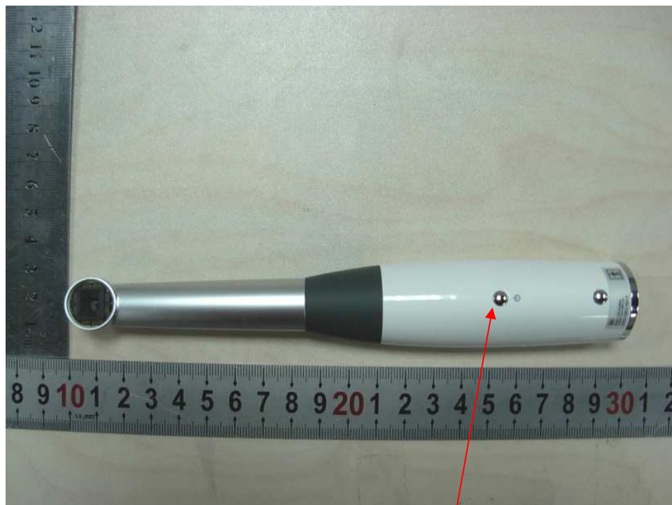
Power On/Off button