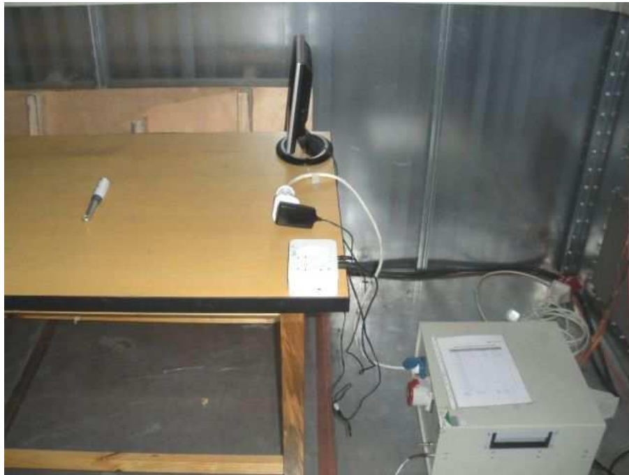
Photograph 1: Set-up for conducted emission