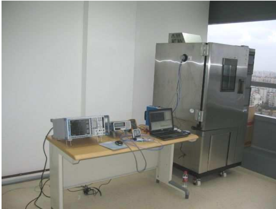
Photograph 3: Set-up for conducted RF tests