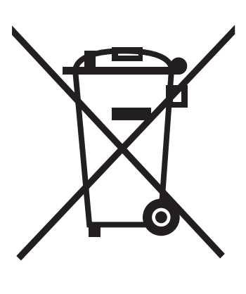
Figure 3: Recycling Label