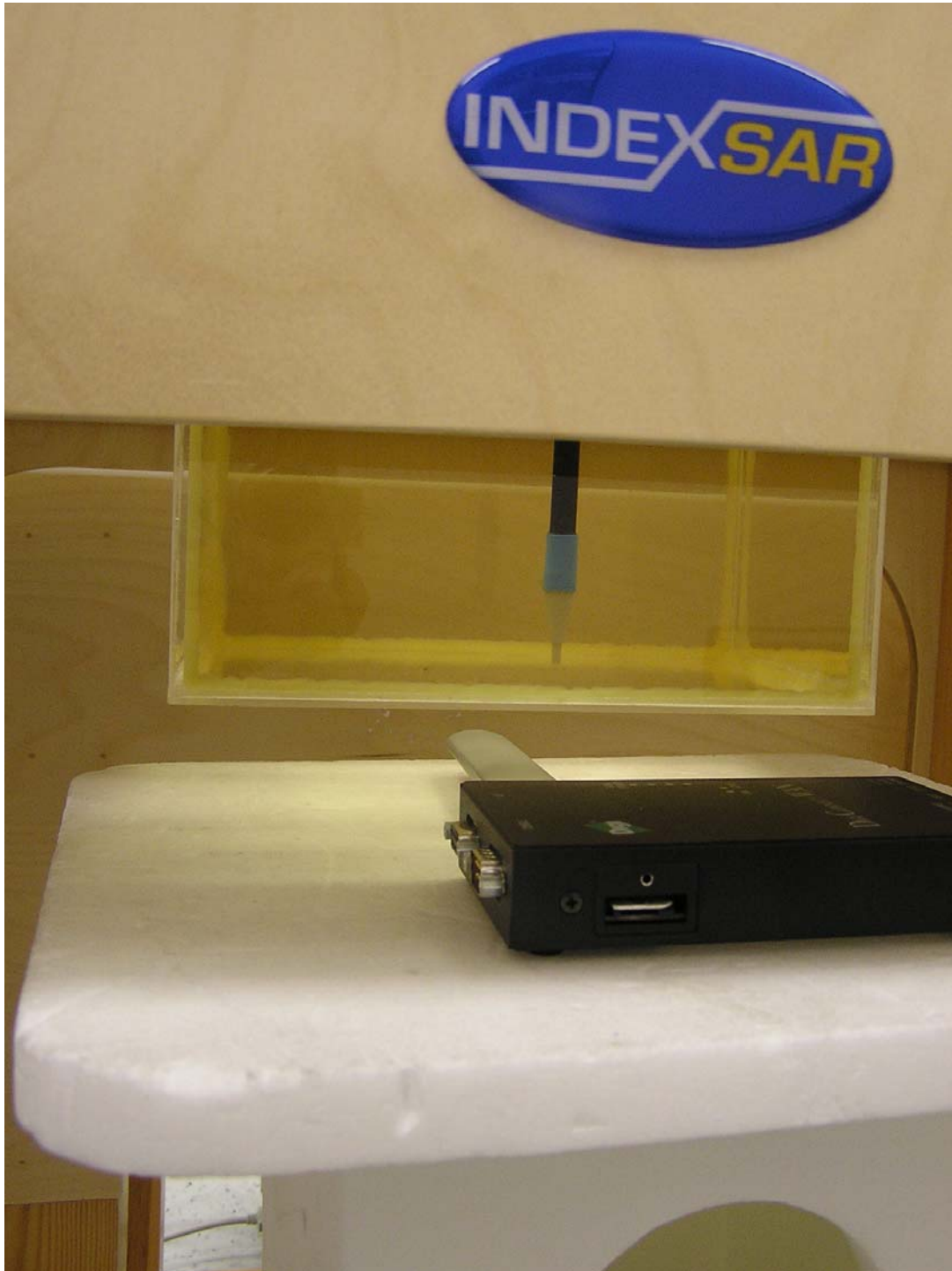
Photo 1. Front Position