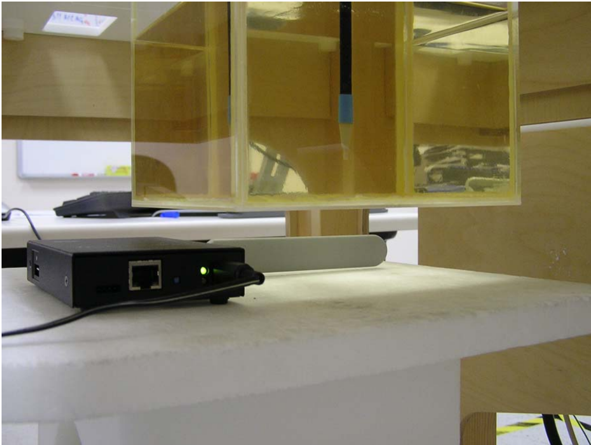
Photo 2. Side Position