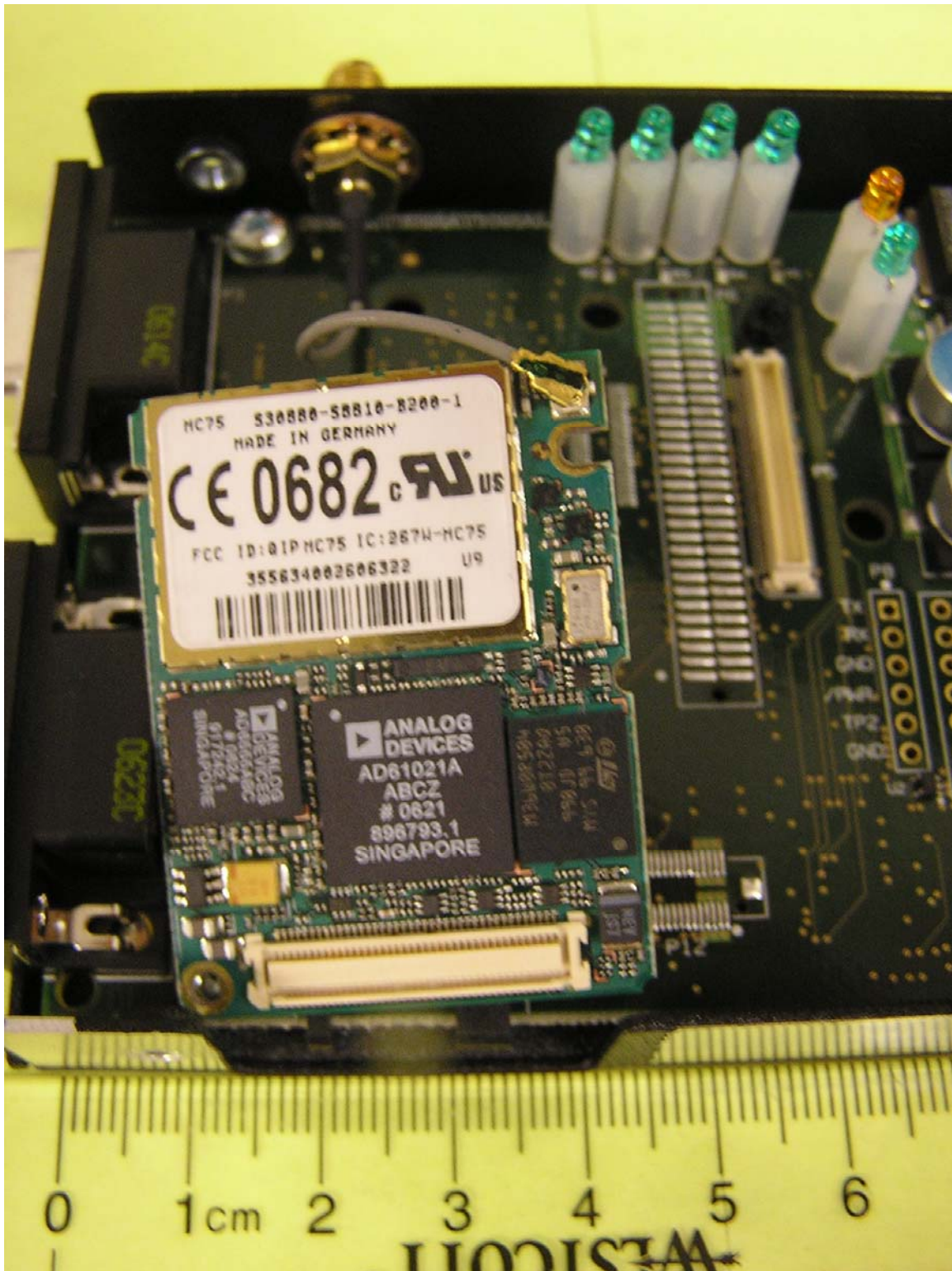
Photo 2. MC75 GSM Module