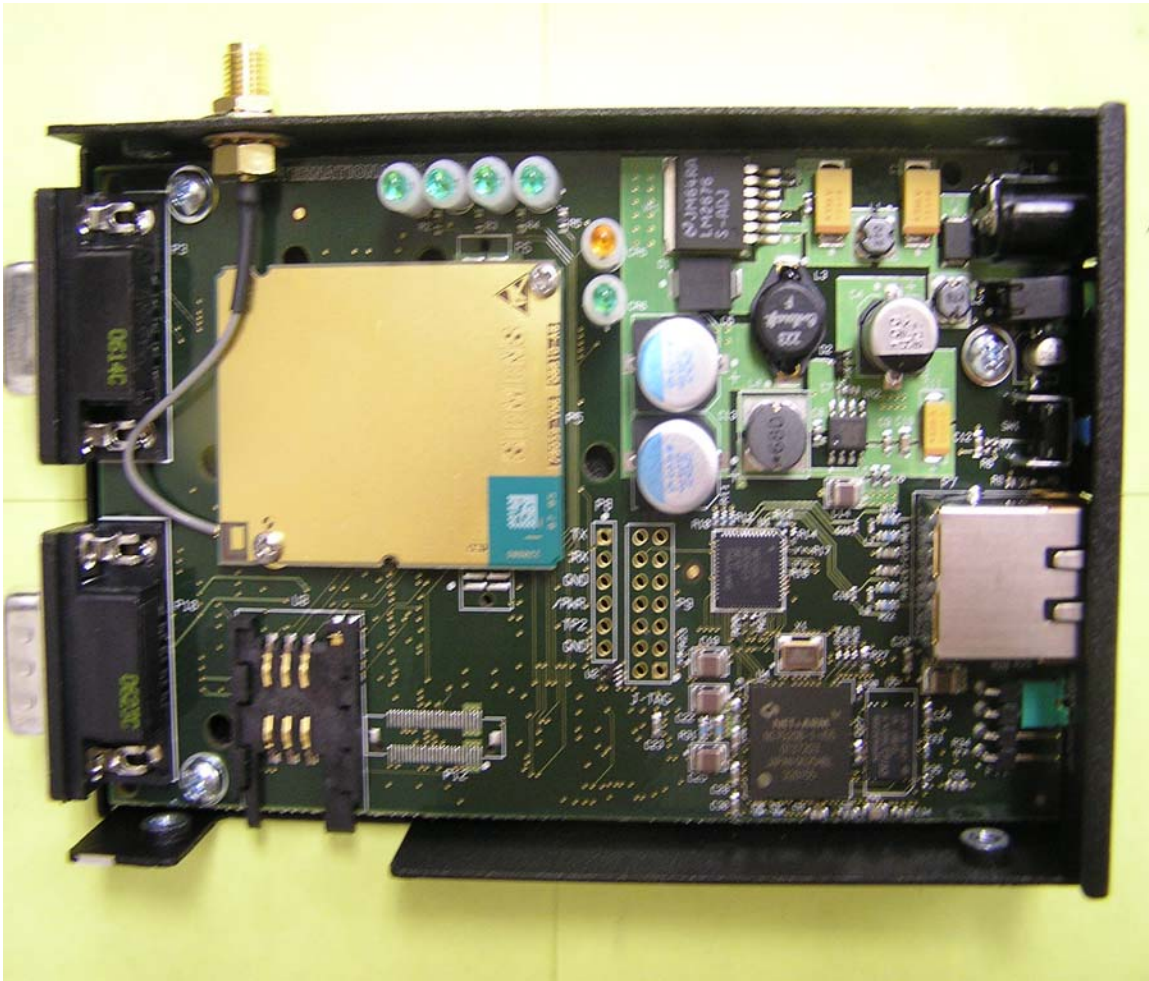
Photo 1. Top view of EUT's PCB Board