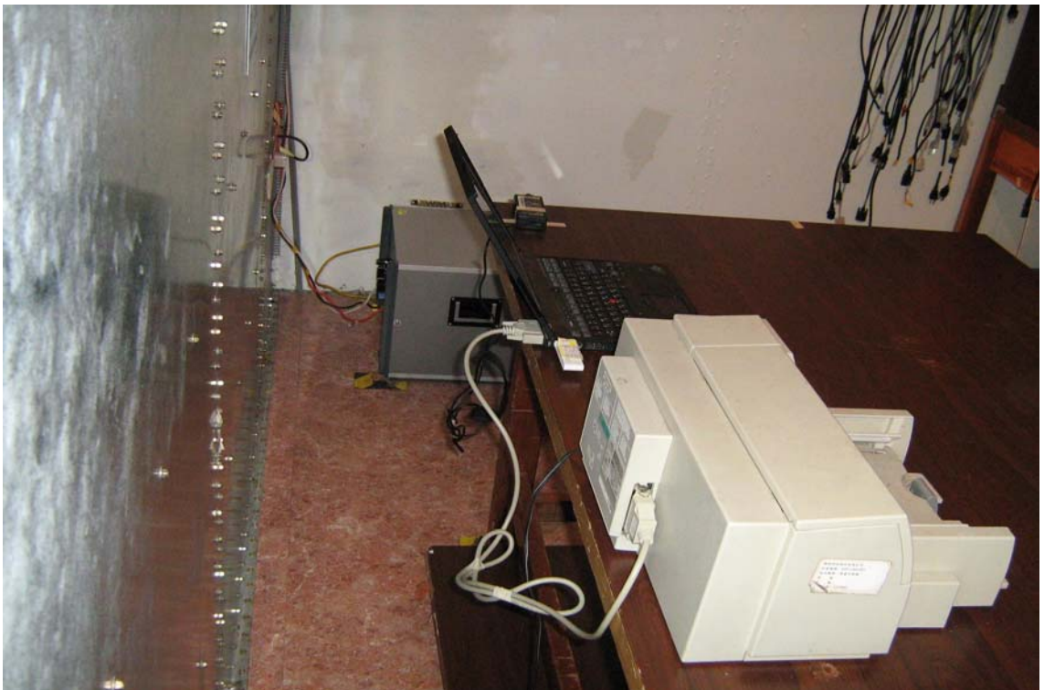
End of report