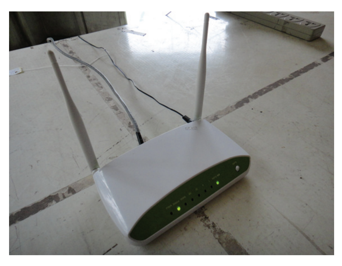
POWERLINE CONDUCTED EMISSIONS MEASUREMENT SETUP