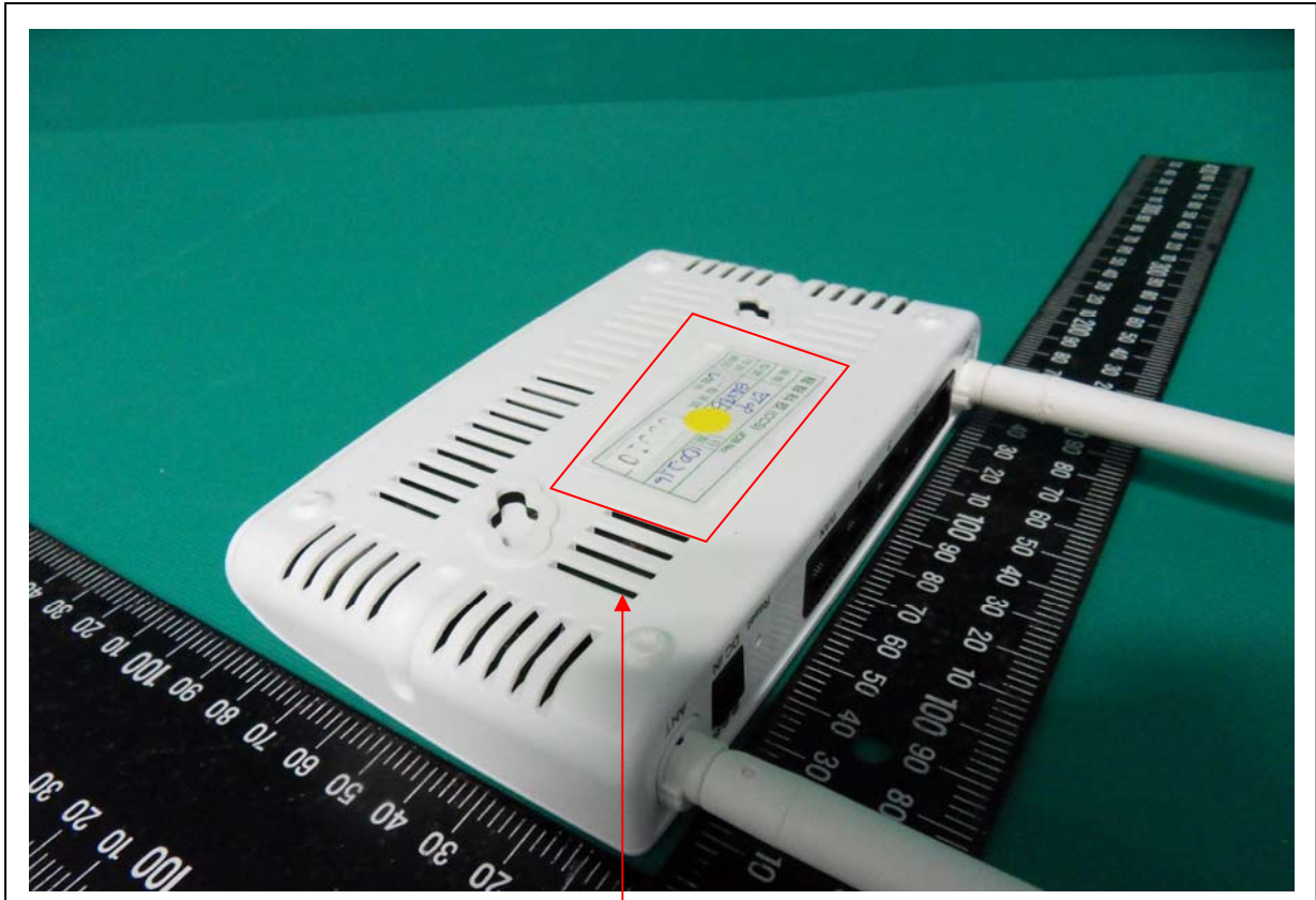
Label location (49mmx29mm)