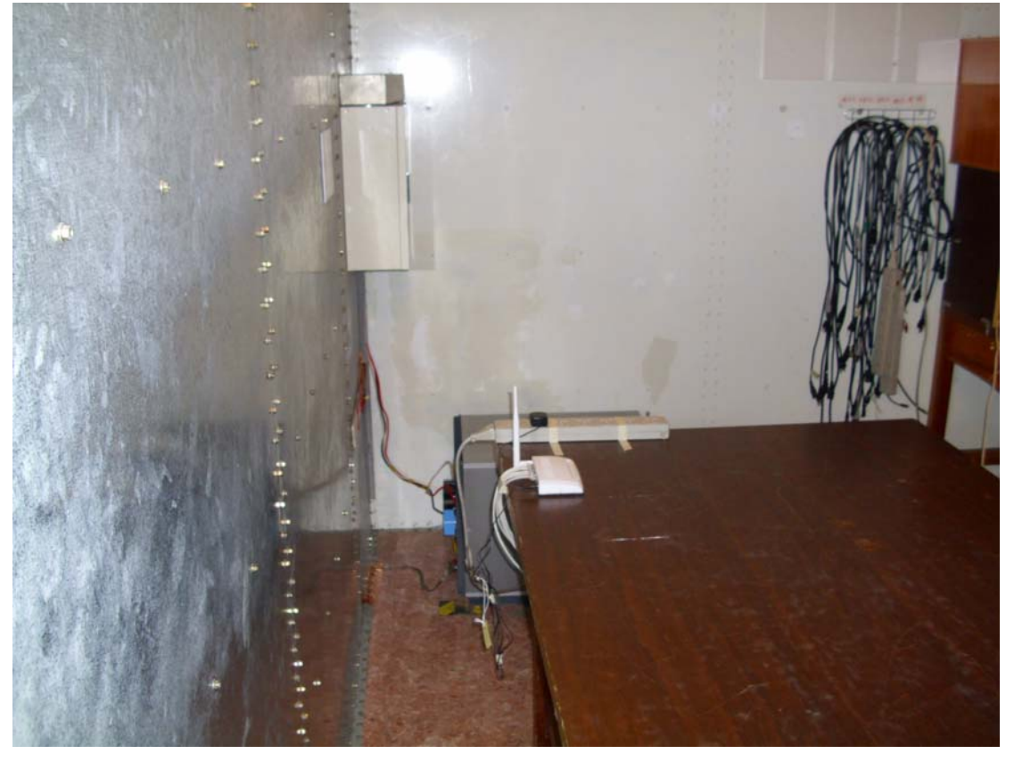
End of report