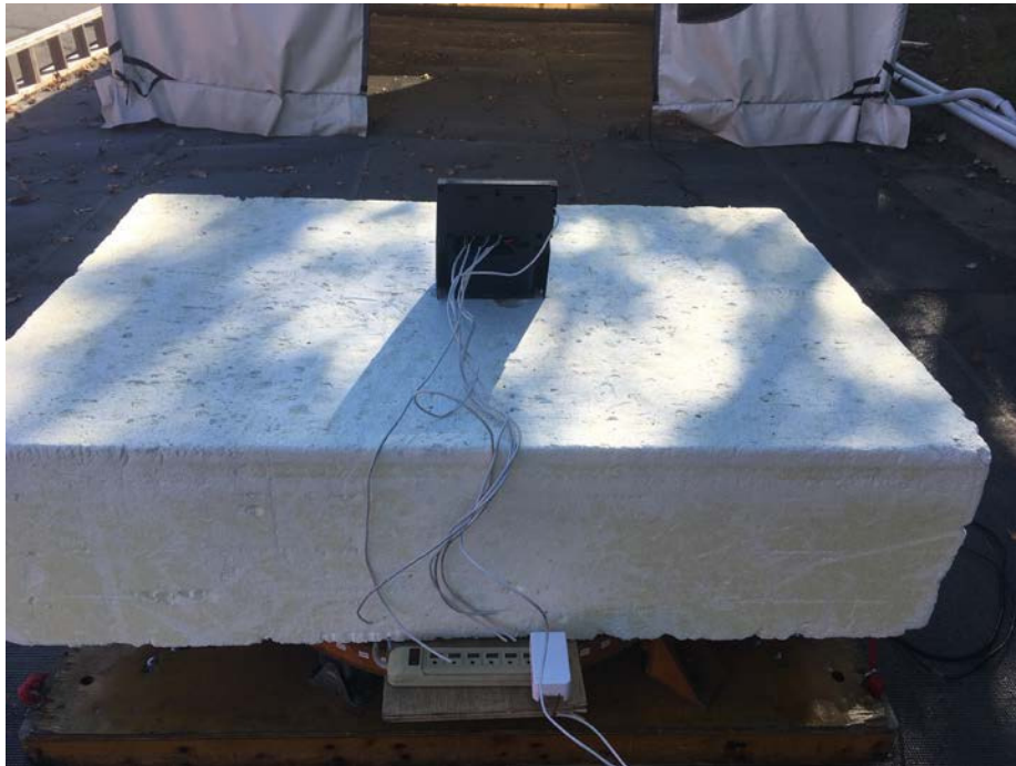
Radiated Emissions (Rear View) < 1 GHz