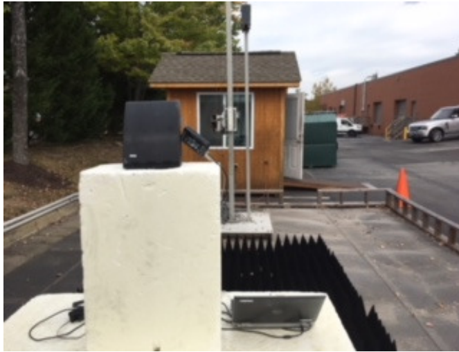
Radiated Emissions (Front View) > 1 GHz