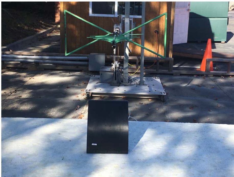
Radiated Emissions (Front View) < 1 GHz