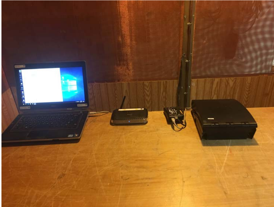
Conducted Emissions - Front View