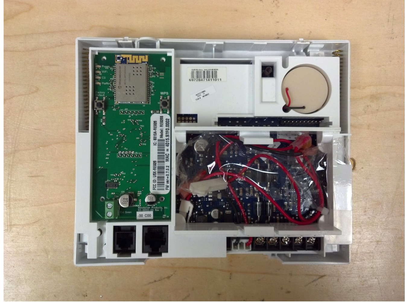
12. The above picture shows the correct installation of the RE926S in the back of the SimonXT.