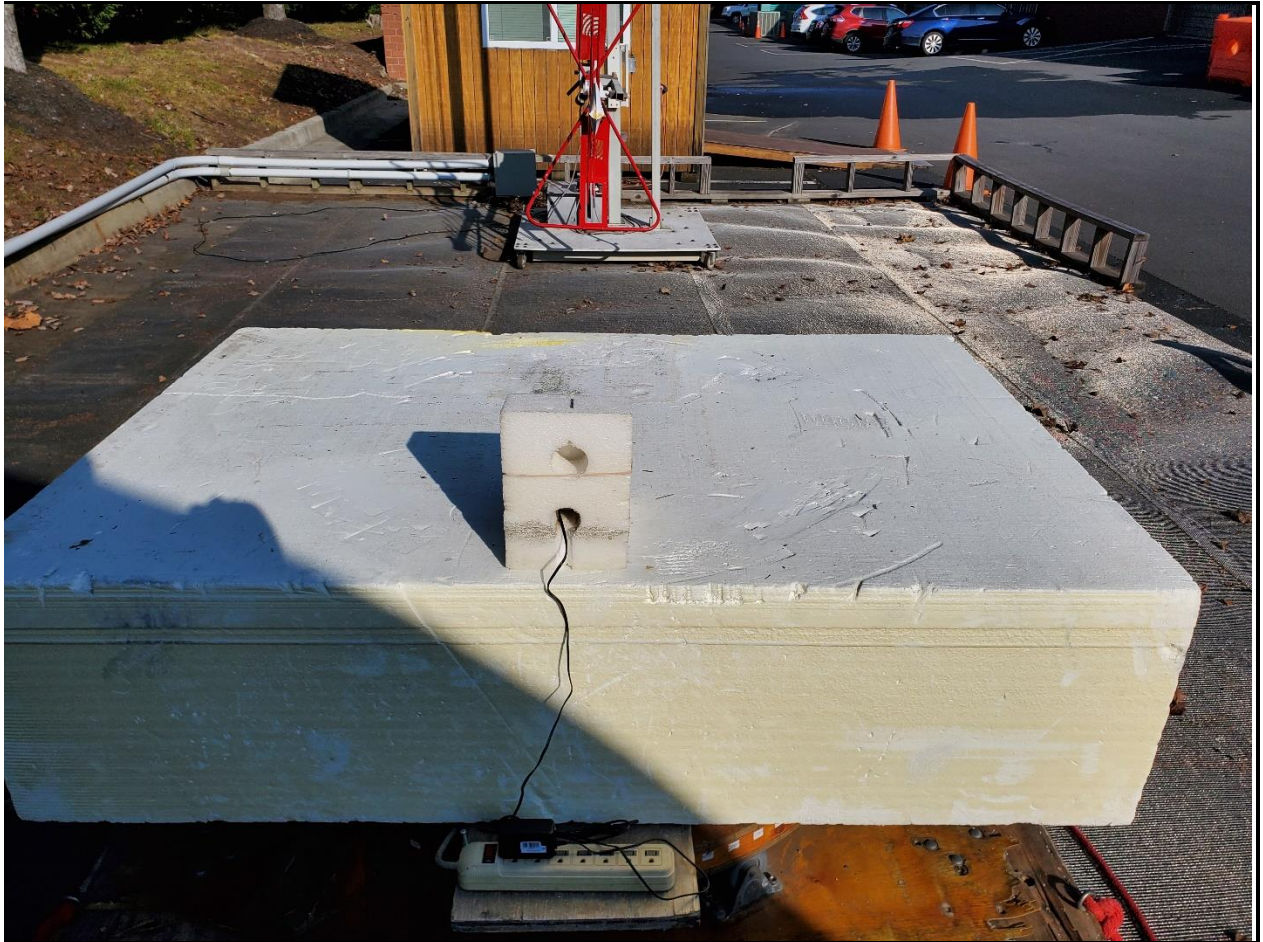
Photograph 2: Radiated Testing – Back View Testing Under 1 GHz