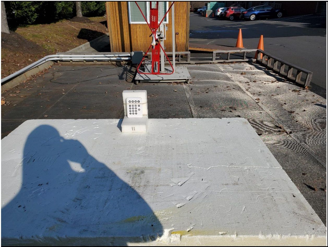
Photograph 1: Radiated Testing – Front View Testing Under 1 GHz