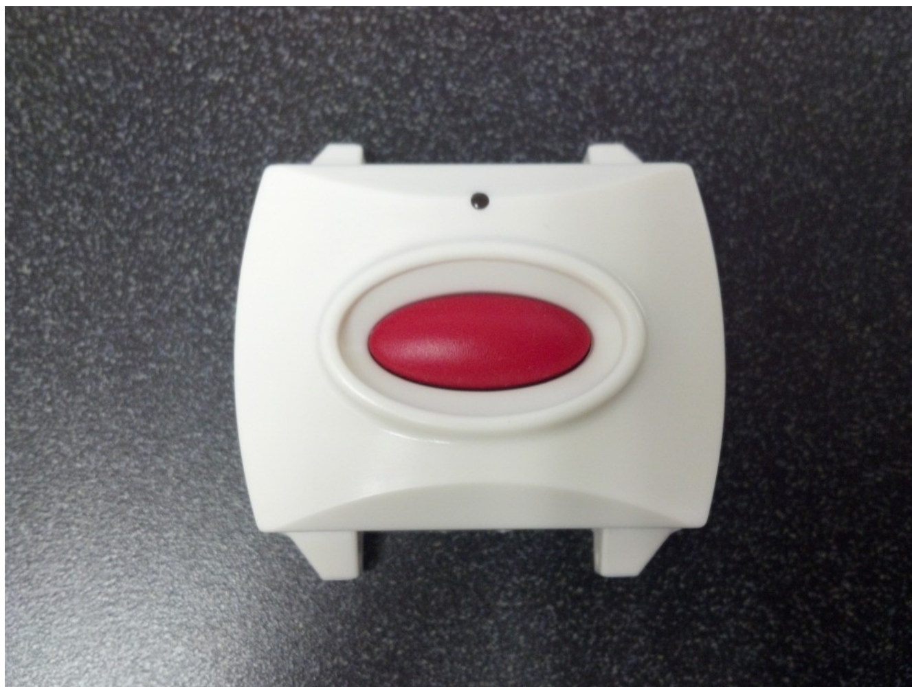
Exhibit A RE403 External Photos