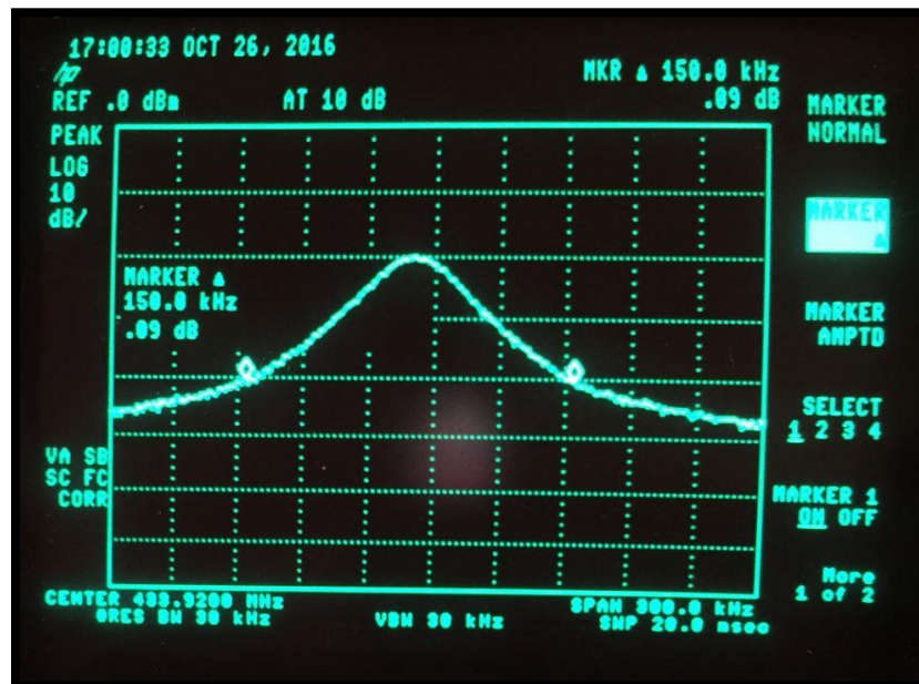
Figure 3: Measured Bandwidth

The plot that follows (made using a Hewlett Packard Model 8594E Spectrum Analyzer) shows the bandwidth of the modulated signal is 150.0 kHz or 0.150 MHz. These measurements show compliance with the bandwidth requirements by a margin of 934.8 kHz or .9348 MHz.