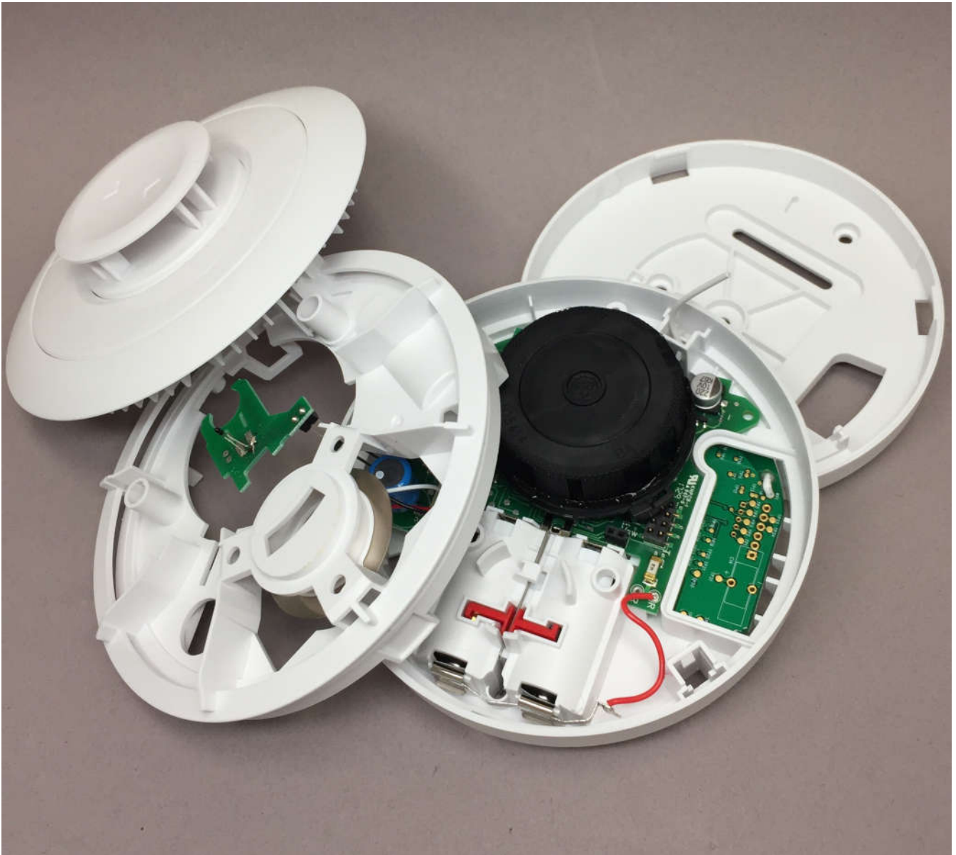
Exhibit C RE214 Internal Photos