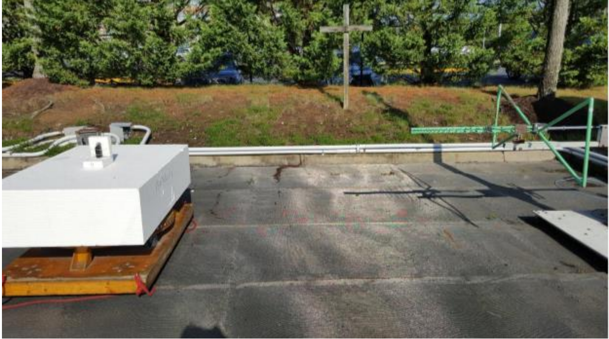
Exhibit J – Test Setup Photos (in each Host Device) FCC ID: U5X-RE207 IC: 8310A-RE207