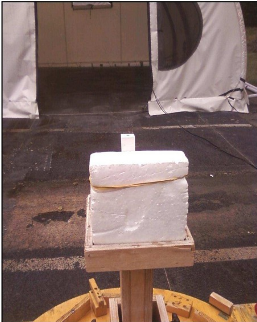
Pencil 345 MHz Back View