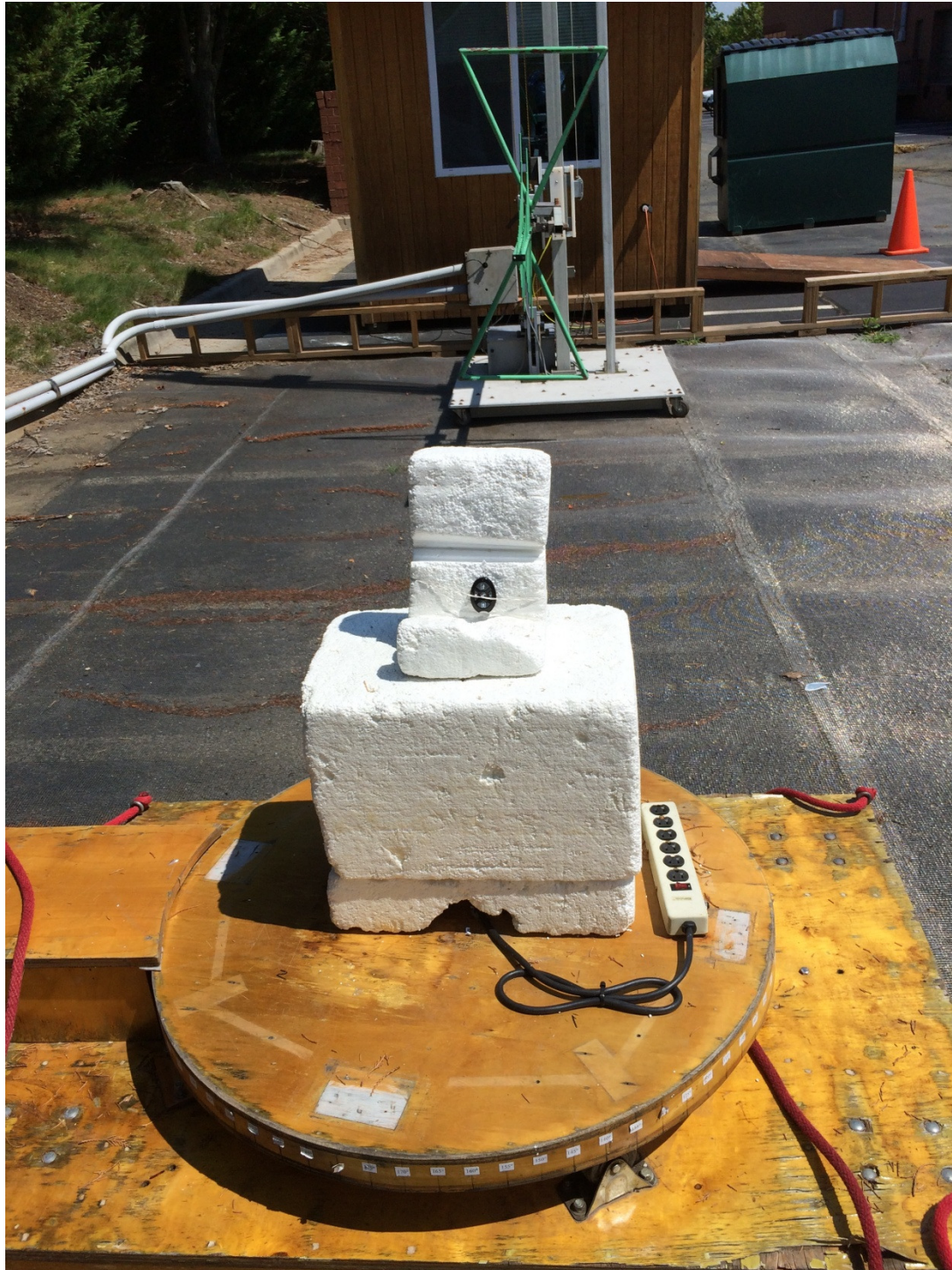
Radiated Emissions (Less Than 1 GHz)