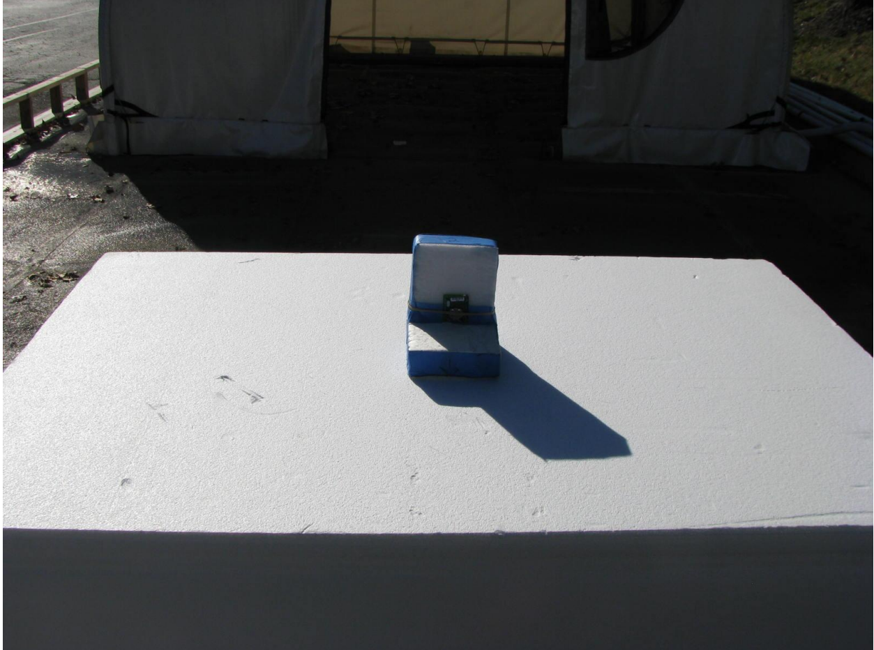
Radiated Emissions - Front