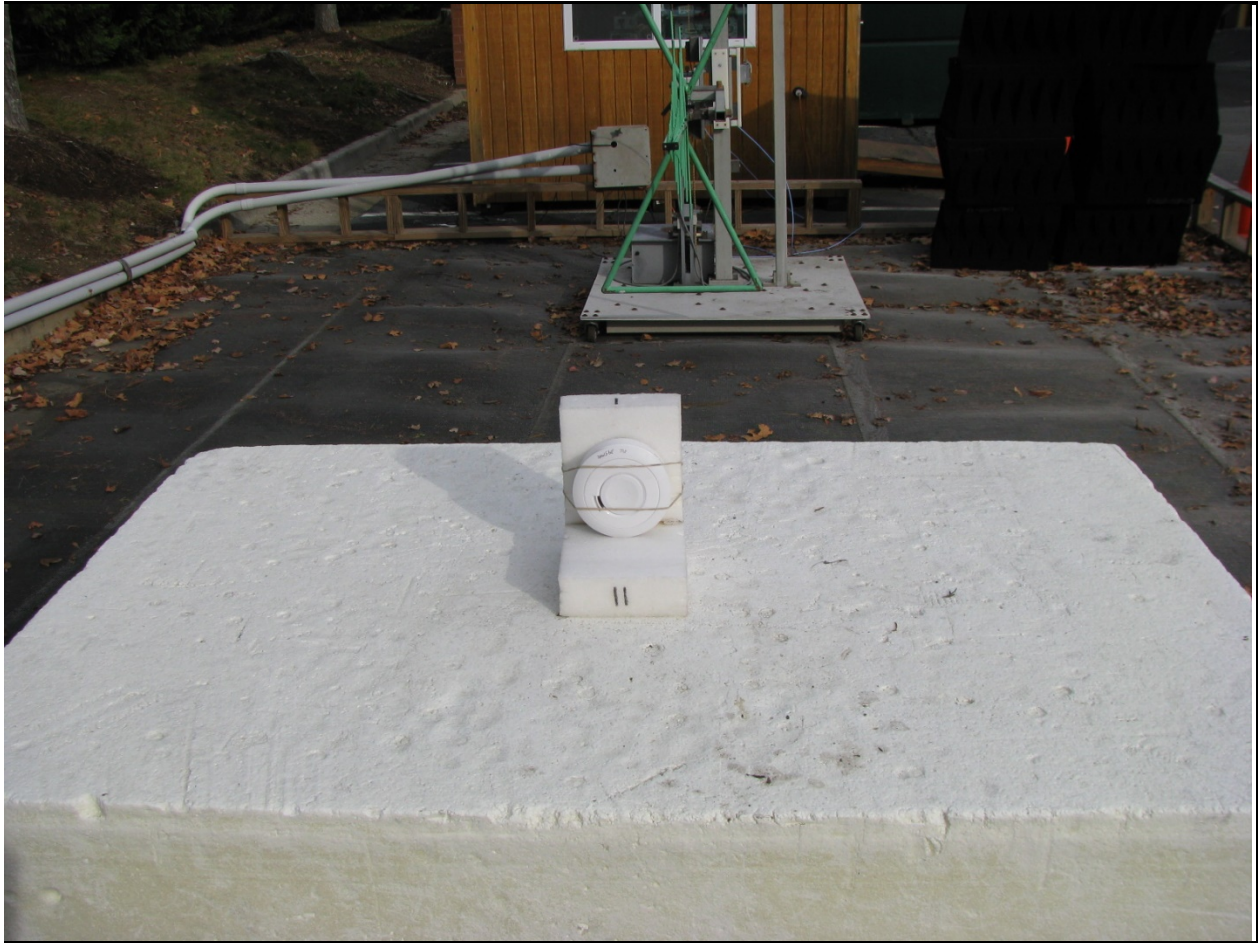
Radiated Emissions (Less Than 1 GHz)