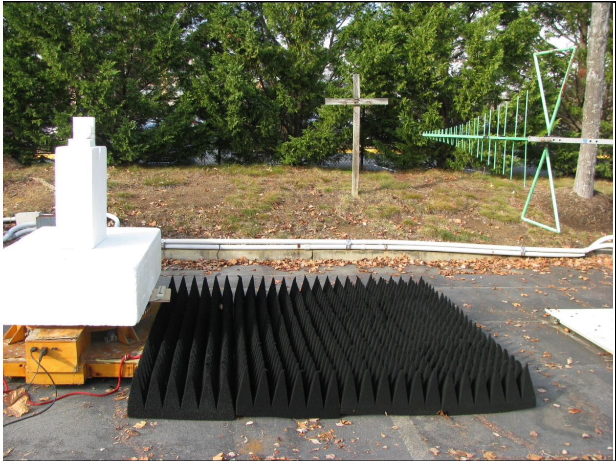
Radiated Emissions (Greater Than 1 GHz)