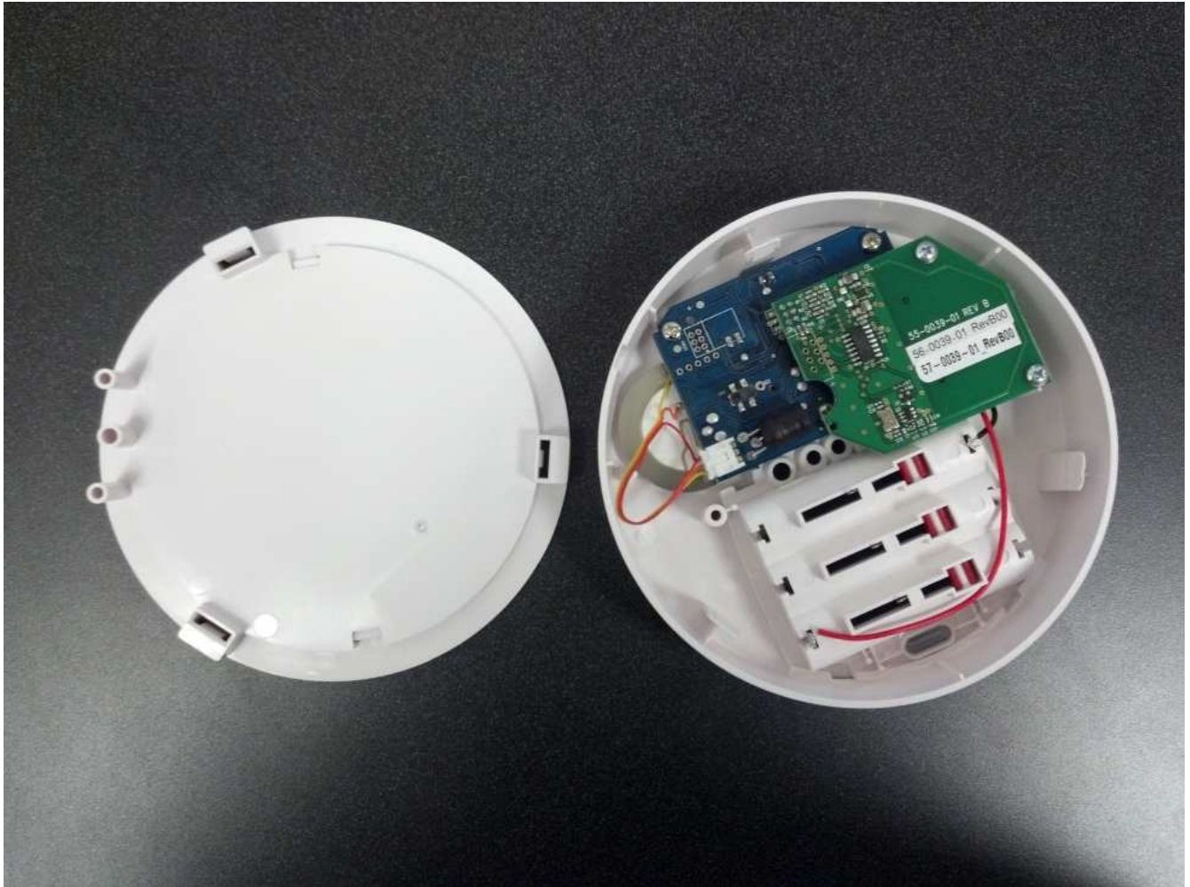
Exhibit C RE113 Internal Photos